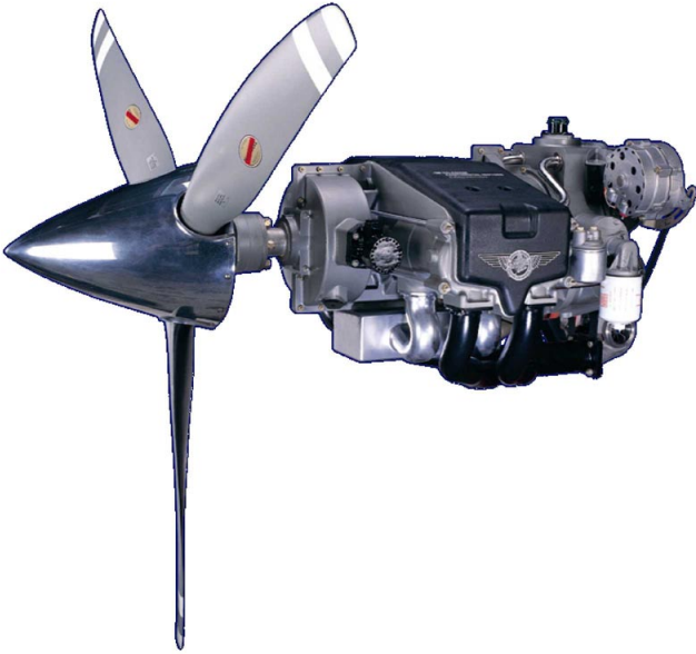
Revolutionary diesel engine developed in the GAP program.

The jet-fueled GAP diesel engine will make possible outstanding new propulsion systems for entry-level aircraft. Such aircraft are usually characterized by a single engine, up to four seats, cruise speeds of 200 knots or less, and easy, well-mannered handling.