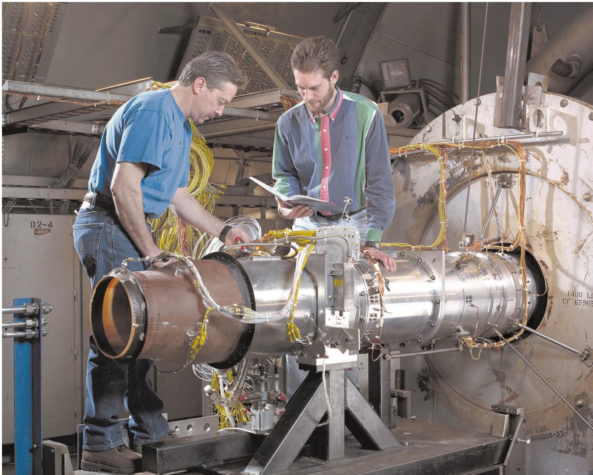
The FJX-2 turbofan engine in Glenn's Propulsion Systems Lab (PSL) altitude test chamber. PSL is NASA's only ground-based test facility capable of true flight simulation for experimental research on air-breathing propulsion systems.

The FJX-2 was developed in partnership with NASA Glenn by Williams International and its industry team (California Drop Forge, Cessna Aircraft, Chichester-Miles Consultants, Cirrus Design, Forged Metals, New Piper Aircraft, VisionAire, Producto Machine, Scaled Composites, and Unison Industries).