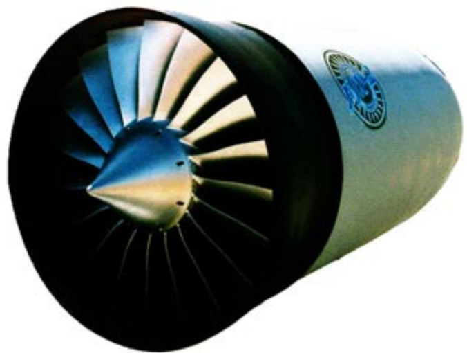
The revolutionary FJX-2 turbofan engine developed in the GAP program.

Modern turbine engines are highly desirable aircraft propulsion systems because they are user-friendly and environmentally compliant. They are characterized by very high reliability, smooth operation, use of readily available jet fuel, and low noise and emissions. Their reliability and smoothness contribute greatly to aircraft safety and comfort. But, until now, the use of turbine engines in the light aircraft market has been limited by high cost.