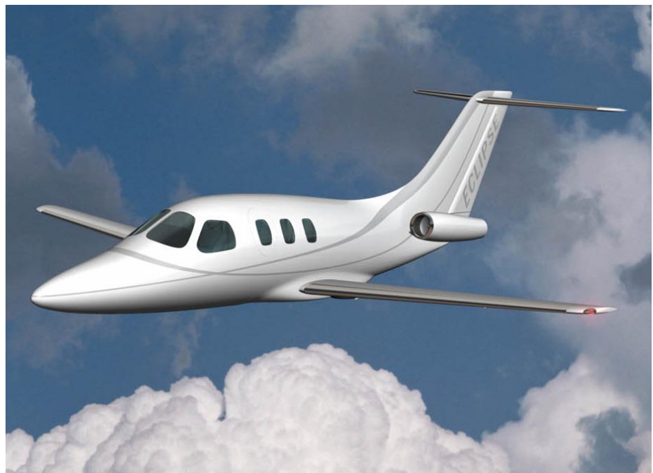
The Eclipse 500 TM , a six-passenger jet made possible by revolutionary EJ22 turbofans, which are commercial derivatives of the GAP FJX-2 turbofan.

The new GAP engines will change all of that, along with our ideas about what general aviation propulsion systems can be. With their smooth, quiet operation, they provide comfort never before enjoyed in general aviation light aircraft. New engines are crucial to truly new airplane designs. The GAP engines are bringing about a revolution in light aircraft affordability, ease of use, and performance.