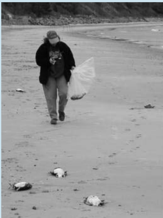
A researcher collects birds that likely died from an outbreak of botulism type E in Lake Erie.

Any discovery of dead or dying water birds and fish showing clinical signs of botulism such as an inability to walk, fly or swim, should be reported to the New York State Department of Environmental Conservation or Ontario Ministry of Natural Resources officials immediately. For information on local offices see your phone book or check the Web site in the United States at www.dec.state.ny.us/ or in Canada at www.mnr.gov.on.ca/MNR/ .