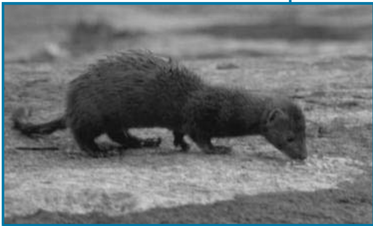
Mink are a good indicator of ecosystem health.

Mink and river otter are making a comeback in the Lake Ontario basin. Their populations were severely reduced in the 1800s due to habitat loss, water pollution and excessive trapping. Prior to these changes the river otter had the largest geographic range of any North American mammal.