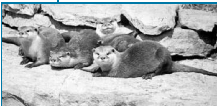
River otter populations are increasing in the Lake Ontario basin.

River otter, found around the eastern end of Lake Ontario, in central Ontario and along the St. Lawrence River, are now moving into western and central New York as more and more abandoned agricultural land returns to natural conditions. Their expansion has been aided by initiatives like the New York River Otter project that released nearly 300 river otters at several locations in central and western New York.