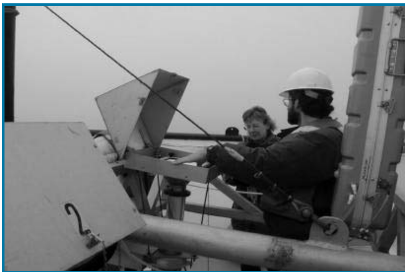
Canadian and U.S. researchers work together to collect air deposition samples.

The LaMP partners will continue sampling in the summer of 2003. Results of the effort will be synthesized to form a report on air deposition to the lake.