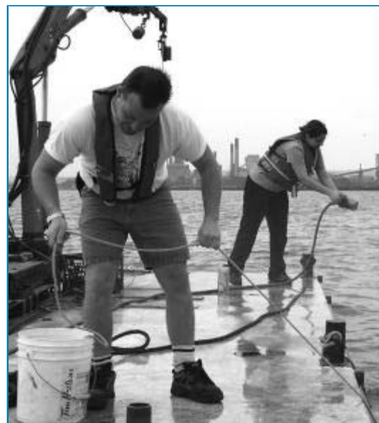
Researchers collect phytoplankton, zooplankton and water samples from Lake Ontario.

or tracking emerging issues, we're always working together with our partners to improve our Great Lake.