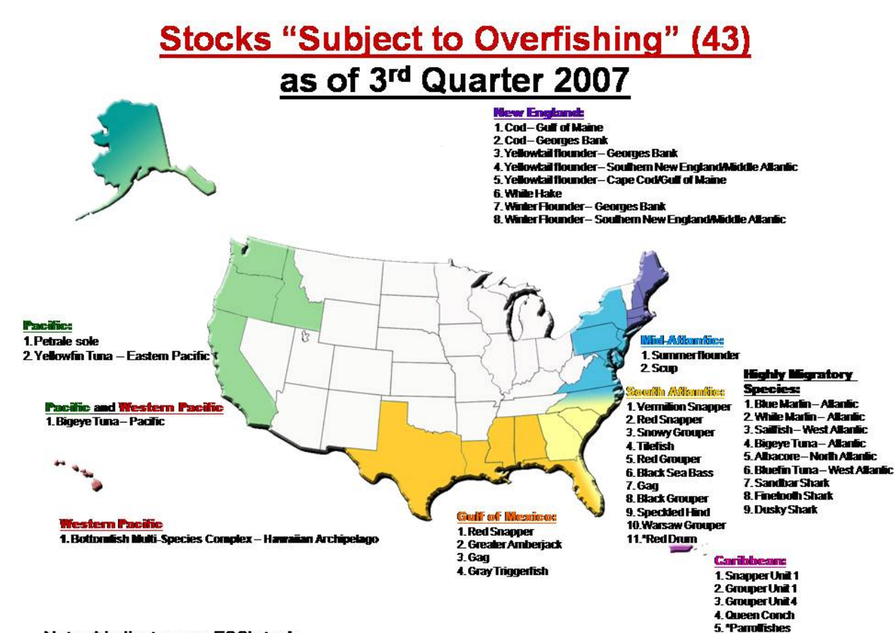
Note: * indicates non-FSSI stock