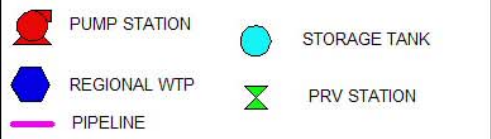
ALTERNATIVE 2 REGIONAL WTP in CURRY COUNTY Peak Day Flow System-Wide Delivery Capacity to Members' Existing Storage