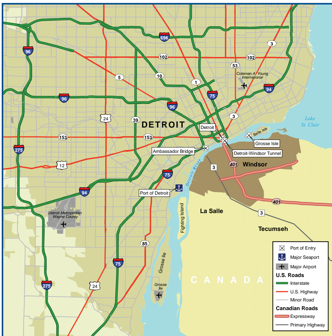
Figure 2. International border between Detroit, Michigan, and Windsor, Ontario.

38,000 vehicles cross the bridge and more than 27,000 vehicles transit the tunnel daily, providing numerous opportunities for the cross-border shipment of drugs and currency. Additionally, there are more than 2 million registered watercraft in Michigan and Ontario, some of which are used by traffickers to transport illicit drugs across the extensive maritime border. The Detroit Metropolitan Wayne County Airport is also used by couriers transporting drugs into and through the region.