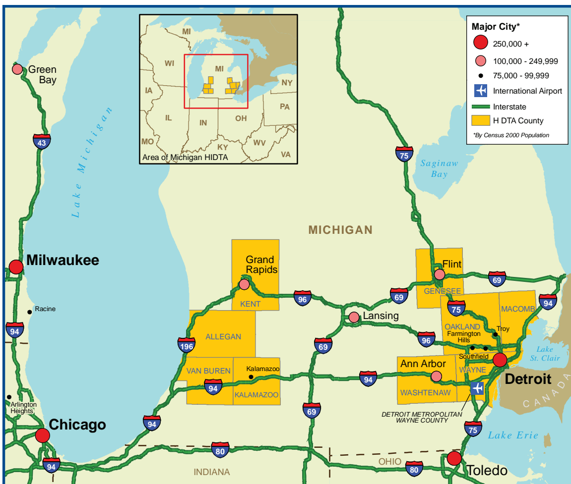
Figure 1. Michigan High Intensity Drug Trafficking Area.

This assessment provides a strategic overview of the illicit drug situation in the Michigan High Intensity Drug Trafficking Area (HIDTA), highlighting significant trends and law enforcement concerns related to the trafficking and abuse of illicit drugs. The report was prepared through detailed analysis of recent law enforcement reporting, information obtained through interviews with law enforcement and public health officials, and available statistical data. The report is designed to provide policymakers, resource planners, and law enforcement officials with a focused discussion of key drug issues and developments facing the Michigan HIDTA.