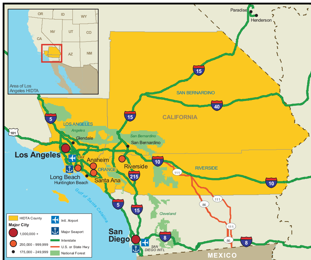
Figure 1. Los Angeles High Intensity Drug Trafficking Area.

reporting, information obtained through interviews with law enforcement and public health officials, and available statistical data. The report is designed to provide policymakers, resource planners, and law enforcement officials with a focused discussion of key drug issues and developments facing the Los Angeles HIDTA region.