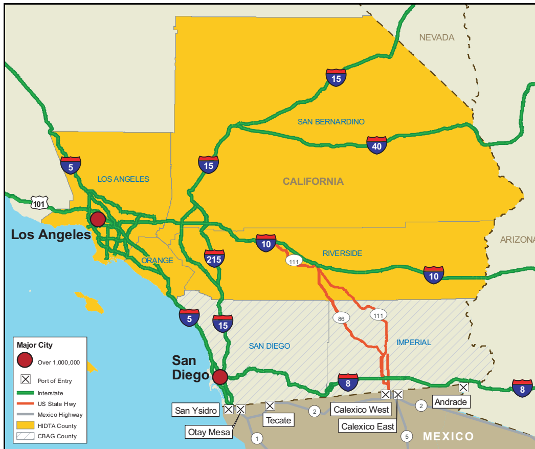
Figure 3. Los Angeles HIDTA transportation infrastructure.

remuneration. Mexican DTOs and criminal groups as well as various other traffickers (Colombian, Jamaican, Asian, Israeli, Russian, Caucasian, and African American) transport illicit drugs to and through the HIDTA region on numerous roadways, including Interstates 5 and 15. These roadways connect the HIDTA region directly to POEs along the California–Mexico (see Figure 3) and the U.S.–Canada borders as well as to other U.S. source areas. For example, Asian and Caucasian criminal groups and independent dealers transport MDMA and high-potency Canadian marijuana into the Los Angeles HIDTA region overland in private vehicles from northern California, the Pacific Northwest, and Canada. In addition, some drug transporters, including some in Europe and Asia, smuggle illicit drugs through the international air and maritime ports situated in or near the Los Angeles HIDTA region, which further augments the HIDTA’s role as an illicit drug transportation center. Some of the