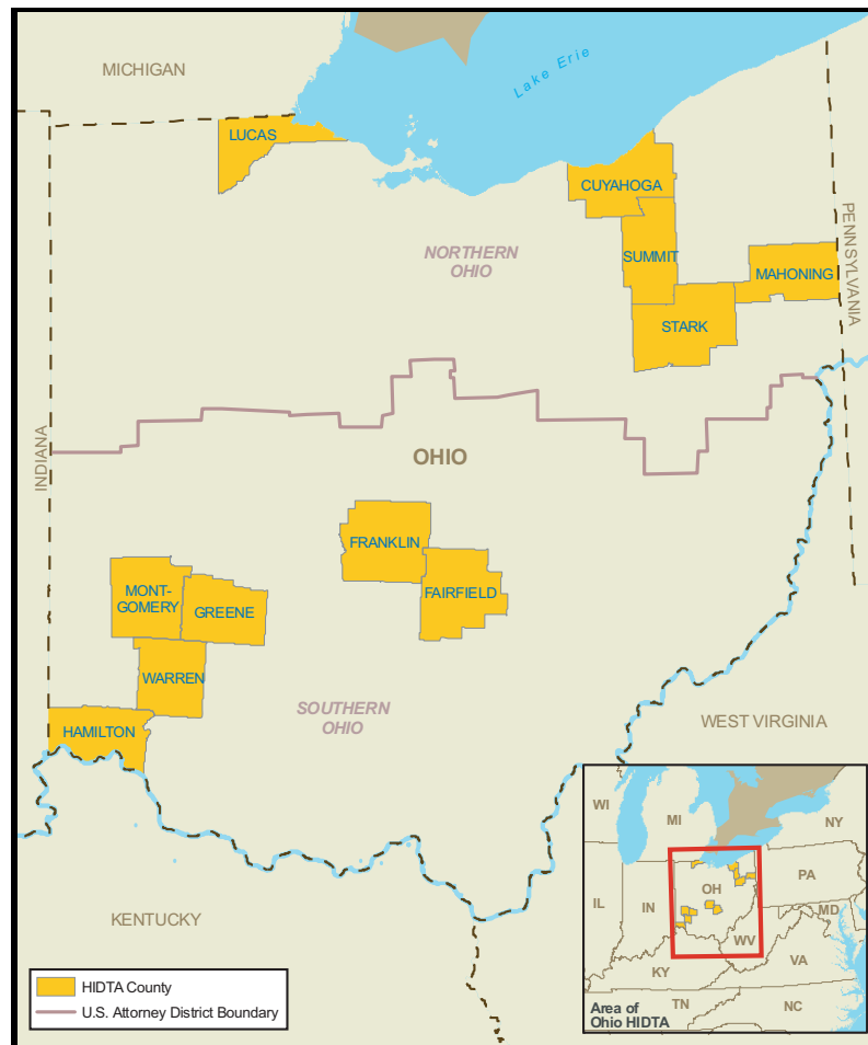
Figure 1. Ohio High Intensity Drug Trafficking Area.

recent law enforcement reporting, information obtained through interviews with law enforcement and public health officials, and available statistical data. The report is designed to provide policymakers, resource planners, and law enforcement officials with a focused discussion of key drug issues and developments facing the Ohio HIDTA.