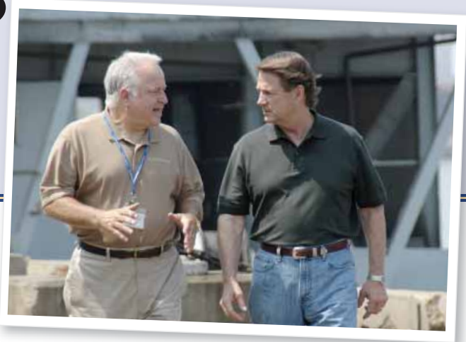
Congressman Melancon talks with a constituent about the Port of St. Bernard.

“As the Third Congressional District's voice in Washington, I have been working hard to make sure our priorities in southeast Louisiana get the funding they deserve. While my focus for the past year has been on helping families and businesses recover from Hurricanes Katrina and Rita, I have also secured over $100 million in non-hurricane related projects for the Third District.”