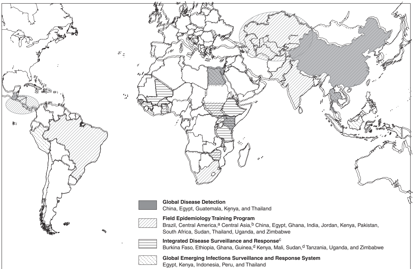
Figure 2: Countries with GDD-, FETP-, IDSR-, or GEIS-Related Activities Supported by U.S. Agencies, 2004-2006

Sources: GAO; Map Resources (map clip art).