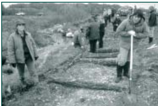
Through its Five-Star Restoration Program, EPA is working with multiple partners to reach a goal of 500 community-based wetland restoration projects across the nation.

If you want to restore a wetland on your property or in your community, many different organizations and agencies can help. Many land-owners are eligible to enroll in federal programs that provide restoration expertise and funding, such as the USDA's Conservation Reserve Program or the Fish and Wildlife Service's Partners for Fish and Wildlife Program . If your project doesn't qualify for such a program or it is a community project involving many different stakeholders, you might want to hire a professional to draft a plan and put together a team to do the work. You can obtain more information through the web sites and resources listed on the reverse.