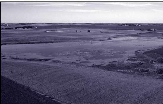
Lynn Betts, USDA NRCS

Iowa farmers, in coordination with USDA, are presently hard at work creating and restoring 9,000 acres of wetlands that are strategically located and designed to be especially effective at removing nutrients and herbicides from agricultural fields. Their project targets the Raccoon River which produces one of the highest nitrogen loads in the Mississippi River Basin. Not only will this project improve conditions in the Gulf of Mexico, but it will also protect drinking water in Iowa.