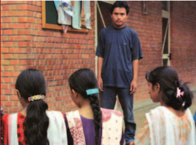
◀ Women rescued in brothels in Indian cities line up to identify an alleged trafficker at a shelter in Nepal.

Many governments struggle to exercise full control over their national territory, particularly where corruption is prevalent. Armed conflicts, natural disasters, and political or ethnic struggles often create large populations of internally displaced persons. Human trafficking operations further undermine government efforts to exert its authority, threatening the security of vulnerable populations. Many governments are unable to protect women and children who are kidnapped from their homes and schools or from refugee camps. Moreover, the bribes paid by traffickers impede a government's ability to