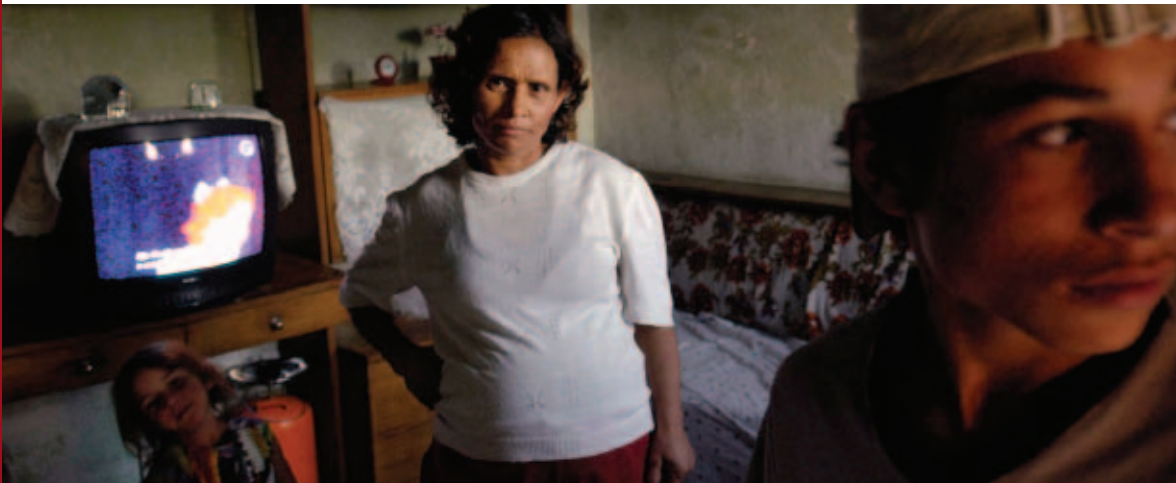
◀ An Albanian woman at her home with her son and the television set she was given by the Italian family to whom she gave one of her sons in 1999.

parent to child and from generation to generation, weakening a core pillar of society. The profits from trafficking often allow the practice to take root in a particular community, which is then repeatedly exploited as a ready source of victims. The fear of becoming a trafficking victim can lead vulnerable groups such as children and young women to go into hiding, with adverse effects on their schooling or family structure. The loss of education reduces victims' future economic opportunities and increases their vulnerability to being trafficked in the future. Victims who are able to return to their communities often find themselves