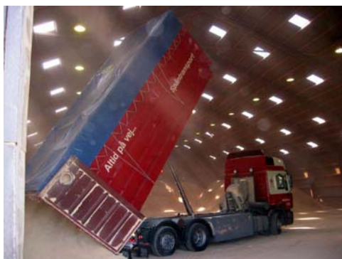
KFK Bioenergy , wood pellet manufacturing plant, Vildbjerg