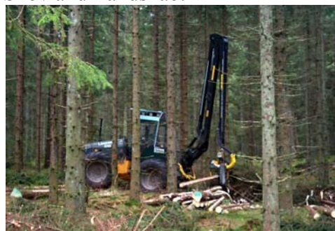
Cut-to-length thinning operation on a 50 year-old Norway spruce plantation in Sweden at $15.00/m 3 .