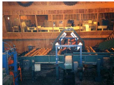
Knarets Sagen, AB – automated small log sawmill in southern Sweden