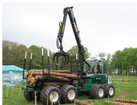
Skov & Teknik forestry equipment show is organized every 4th year by Skov and Landskab.