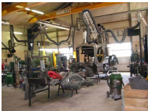
Silvatec , company manufacturing chippers and harvesters, Farso. It takes 3 weeks to manufacture a complete harvester.