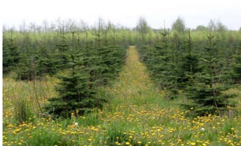
Urban forest afforestation project in several locations outside of Aarhus