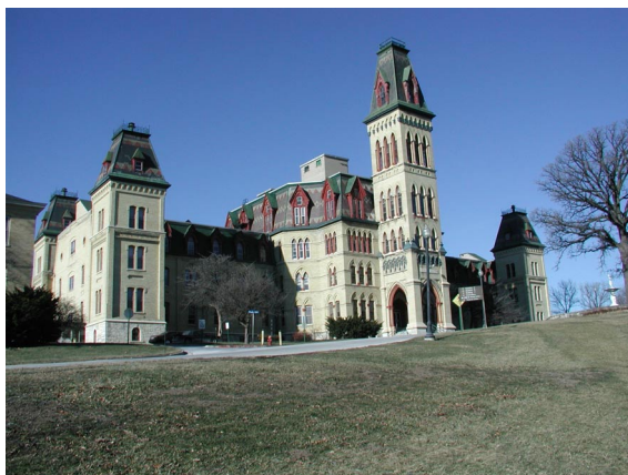
Figure 1: The Former Main VA Hospital Building at the Milwaukee, Wisconsin, Health Facility Campus