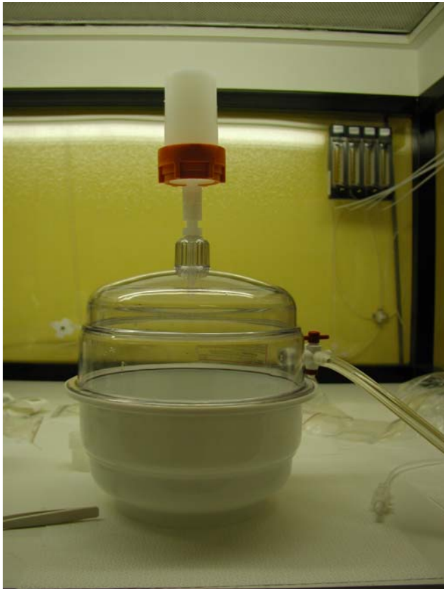
Figure 1. Vacuum-desiccator filtration chamber with a modified Savillex® PFA/PFTE filtration assembly attached.