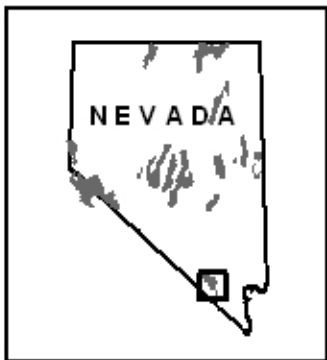
EXHIBIT A Forest Order 04-17-08-08 Fire Restriction

Humboldt-Toiyabe National Forest Spring Mountains National Recreation Area