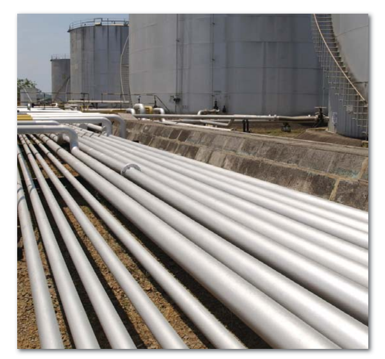
Oil Storage Pipes at a refinery transport oil to its storage tanks.

Besides being the lowest cost way to store oil for long periods of time, the use of deep salt caverns is also one of the most environmentally secure. At depths ranging from 2,000 to 4,000 feet (610 - 1,220 meters), the salt walls of the storage caverns are "self-healing." The extreme geologic pressures make the walls rock hard, and should any cracks develop in the walls, they would be almost instantly closed.