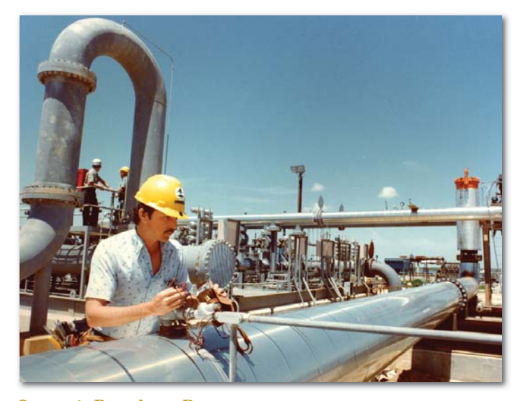
Strategic Petroleum Reserve A technician at the Strategic Petroleum Reserve inspects crude oil transfer pipes.