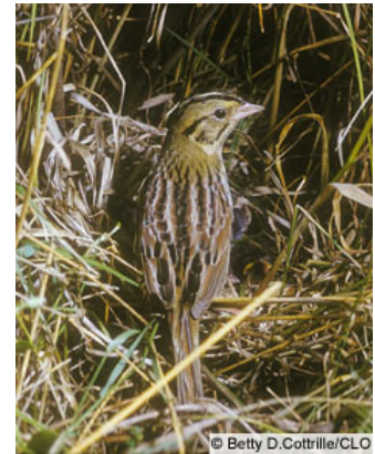
▲ Henslow's Sparrow