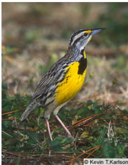
▲ Eastern Meadowlark

The goal of this practice is to establish a mosaic of grasslands and wetlands in a predominately agricultural landscape, resulting in more favorable habitat conditions for self-sustaining populations of waterfowl, pheasants, and grassland songbirds.