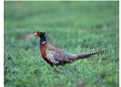
▲ Ring-necked Pheasant