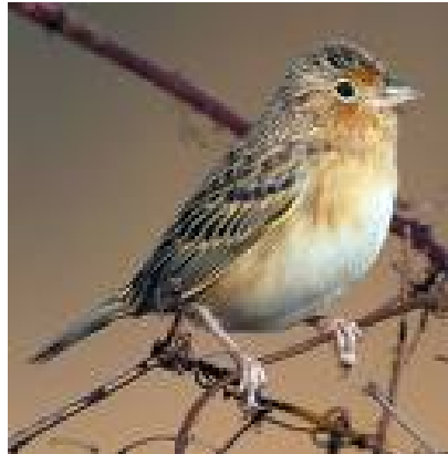
▲ Grasshopper Sparrow