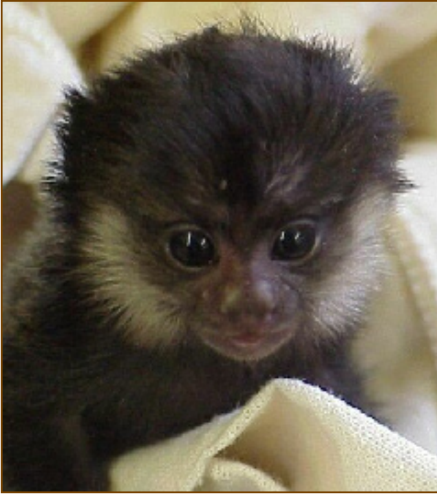
Infant Wied's black tufted-ear marmoset, Callithrix kuhlii.

a marmoset or tamarin be housed with a New World primate from the Family Cebidae, including squirrel monkeys, capuchins, spider monkeys. Cebids can carry viruses, such as Herpesvirus saimiri, that do not affect their own health but could be lethal for marmosets and tamarins.