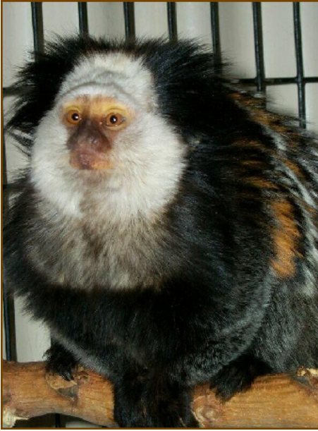
Adult Geoffroy's marmoset, Callithrix geoffroyi.