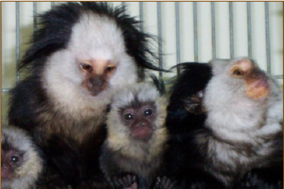
Marmoset (Callithrix geoffroyi) parents sitting with their infants.