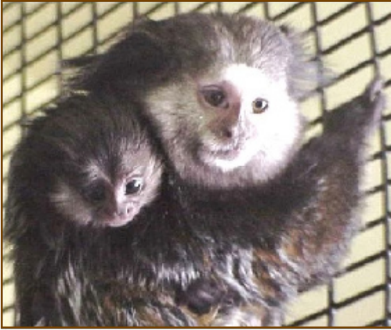
Subadult male marmoset (Callithrix kuhlii ) carrying infant sibling.

In captive settings, callitrichid primates are commonly housed in groups comprised of a single breeding adult male and female, along with the independent (subadult and juvenile) and dependent (infant) offspring of the breeding pair. Captive groups generally do not contain unrelated individuals, because social groups containing unre-