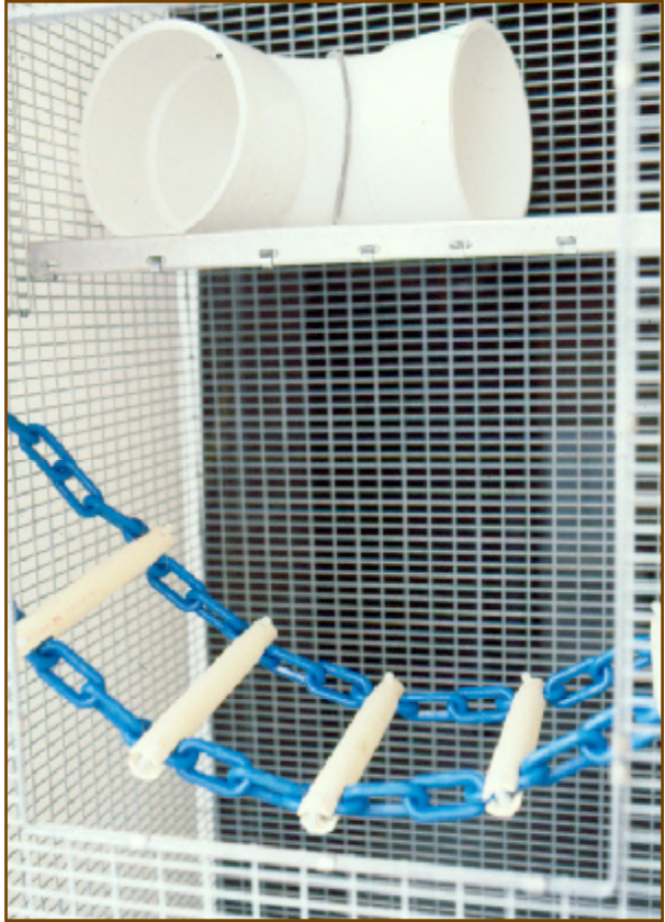
Example of basic cage with ladder/swing and polyvinyl chloride (PVC) nestbox. Branches can be added for scent-marking.

Meeting the nutritional needs of callitrichid primates is essential to their health and well-being in captivity. The diets of wild marmosets and tamarins include tree exudates (sap or gum), fruits, buds and flowers, nectar, insects, and small vertebrates. Since proportions vary between and within species, only general nutritional issues will be covered here. However, it is important to avoid over-feeding these animals with food treats such that they do not consume a nutritionally balanced diet. Further detailed information can be found in the Callitrichid Husbandry Manual.