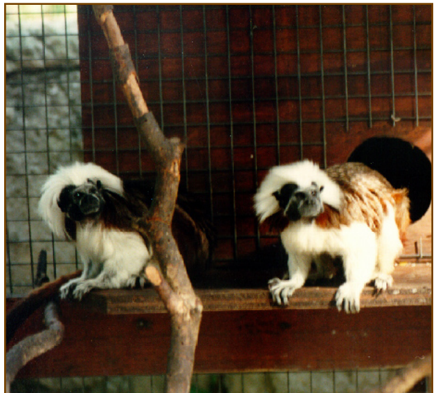
Cotton-top tamarin (Saguinus oedipus) with nestbox and perches.

Other distinguishing morphological features of marmosets and tamarins include claws instead of nails on all digits except for the opposable hallux, and two molars on either side of each jaw.