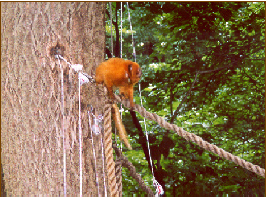
Golden Lion Tamarin (Leontidius sp.) using a rope crossing between trees.