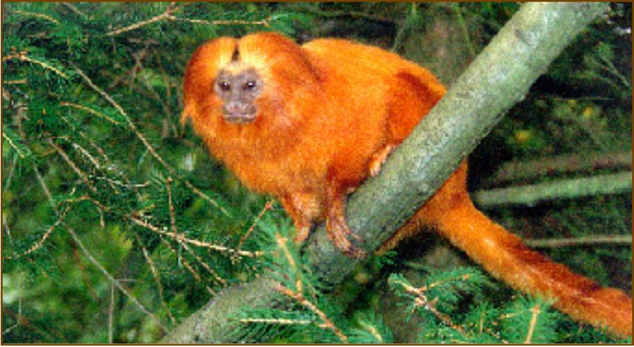
Golden Lion Tamarin (Leontideus sp.) perching on a branch.