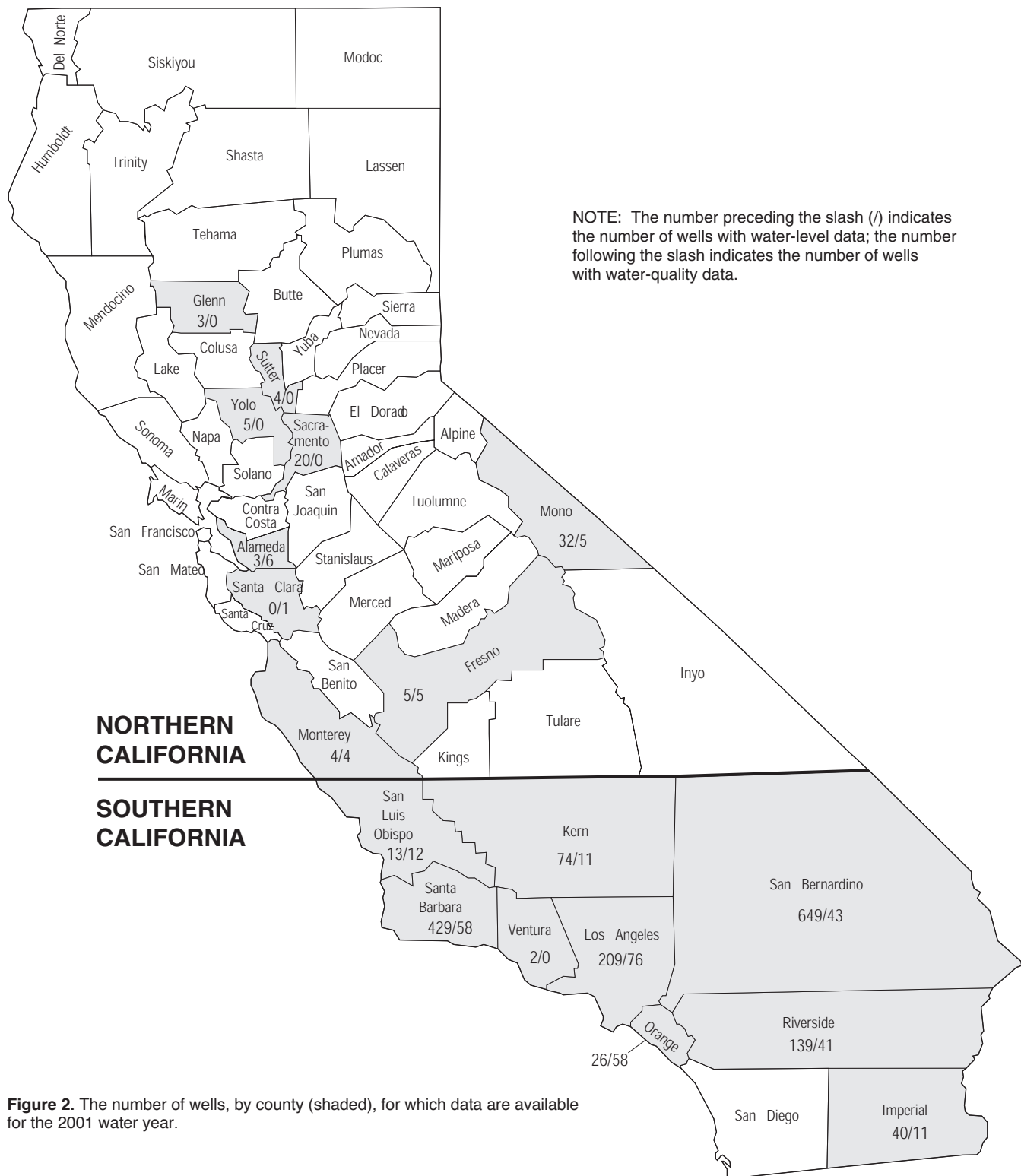
Figure 2. The number of wells, by county (shaded), for which data are available for the 2001 water year.