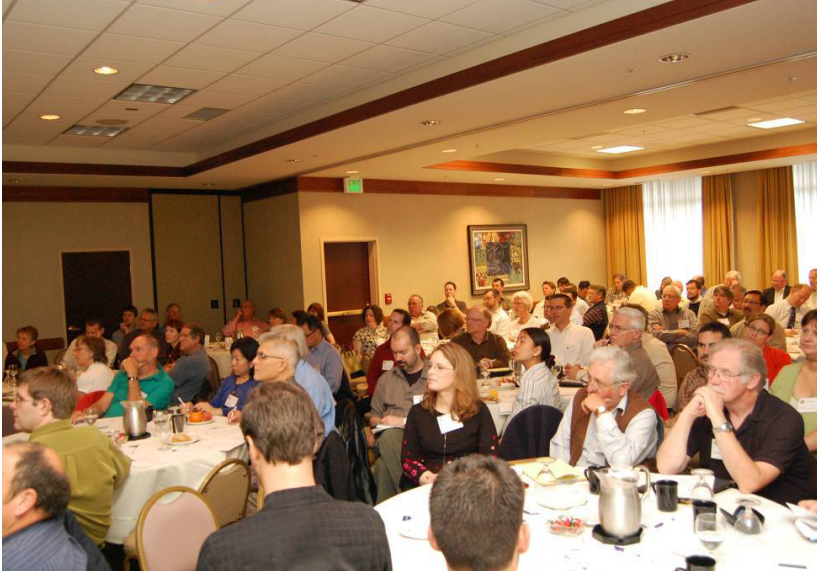
Audience at Access Forum in Seattle

the federal Fair Housing Act's accessibility requirements and to celebrate partnerships that have successfully produced accessible multi-family housing in which everyone profits – developers and consumers alike. The theme of the event is "Good Access is Good Business." Previous events were held in Miami, Minneapolis, Phoenix, Atlanta, Dallas, and Washington, DC.