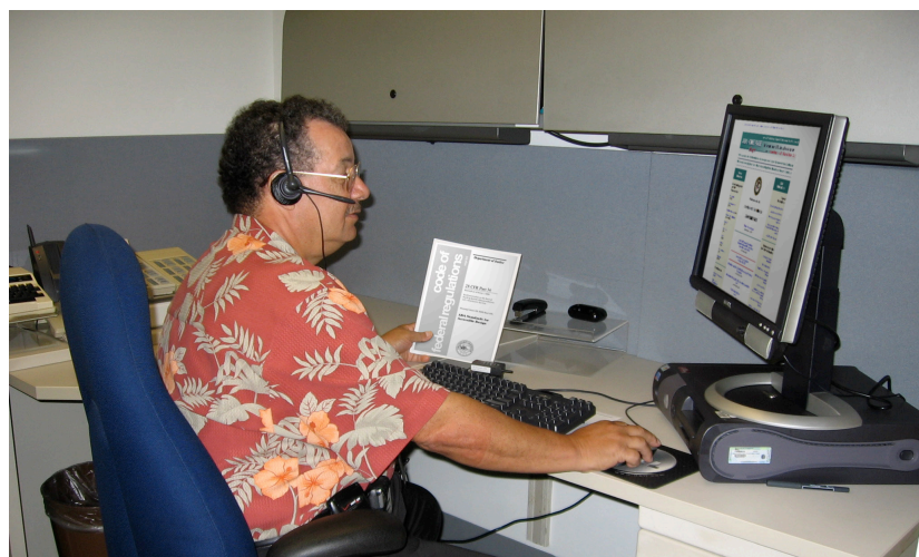
ADA Specialist answering a call to the ADA Information Line