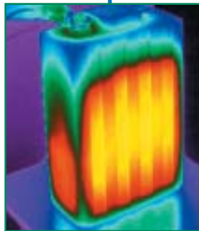
Thermal imaging of a battery used in HEVs