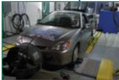
Vehicle testing in laboratory