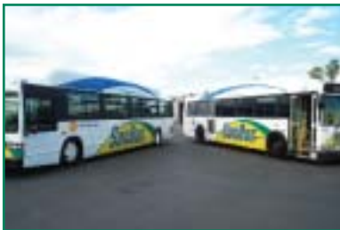
Hydrogen fuel cell buses