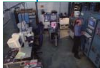
Unique battery test laboratory

Energy management strategies depend on accurate vehicle simulation. Our team has developed an effective modeling software package called ADVISOR (ADvanced VehIcle SimulatOR), which provides vital information about vehicle efficiency, performance, and emissions. ADVISOR can simulate HEVs and other advanced and conventional vehicles. Automakers, along with universities and component