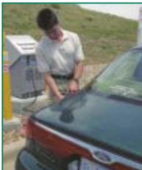
Filling up on alternative fuel