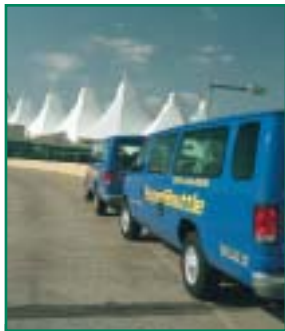
Evaluating natural gas vans

CTTS is also expanding its efforts to develop the Digital Functional Vehicle, the next step in simulation and modeling software that integrates numerous math-based engineering tools and data to optimize energy efficiency during vehicle design.