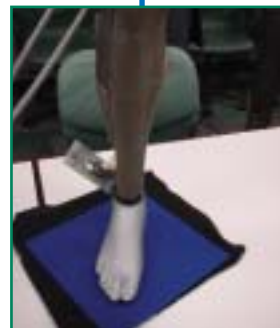
Manikin limb to test passenger thermal comfort