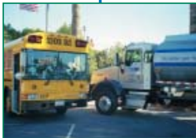
Fuel evaluation in fleet vehicles