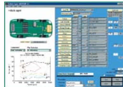
Graphical user interface screen for ADVISOR