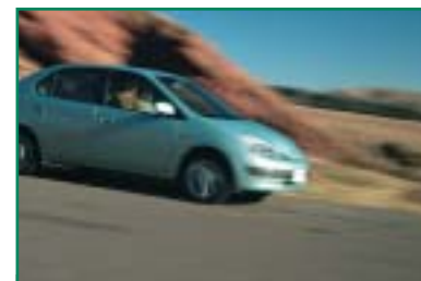
HEV on-road testing