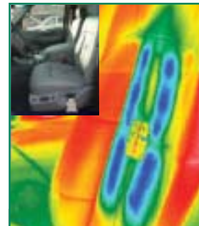
Cooled and ventilated seats to reduce AC load