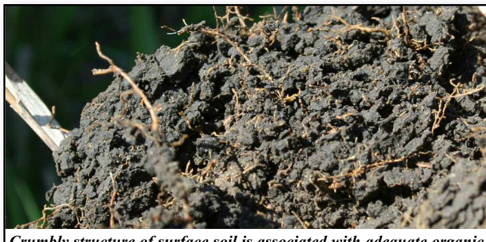
Crumbly structure of surface soil is associated with adequate organic matter content.