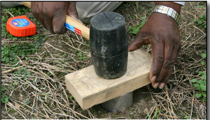
A three inch diameter ring is hammered into the soil to collect bulk density samples.

Dynamic - Bulk density is changed by crop and land management practices that affect soil cover, organic matter, soil structure, and/or porosity. Plant and residue cover protects soil from the harmful effects of raindrops and soil erosion. Cultivation destroys soil organic matter and weakens the natural stability of soil aggregates making them susceptible to damage caused by water and wind. When eroded soil particles fill pore space, porosity is reduced and bulk density increases. Cultivation can result in compacted soil layers with increased bulk density, most