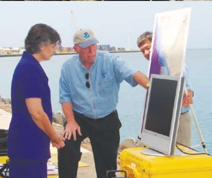
(Top) Governor Lingle is joined by Jean-Michel Cousteau during a visit to Midway Atoll National Wildlife Refuge in the Northwestern Hawaiian Islands.