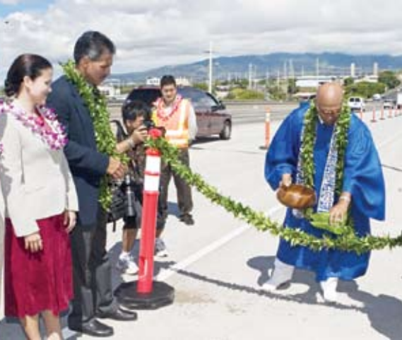
(Top) Kahului Boat Ramp dedication.