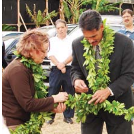
(Top) Governor Lingle and Kukui Gardens residents.