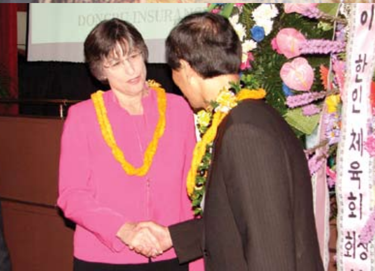
(Top) National Federation of Independent Businesses (NFIB) breakfast. (Bottom) Governor Lingle meets with a representative of Dongbu Insurance, a captive insurance company.