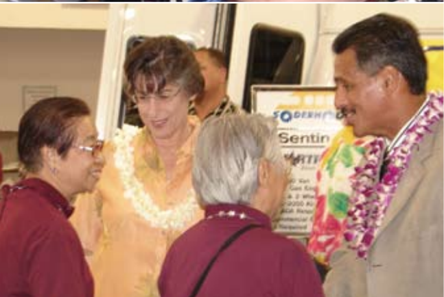
(Top) Kona International Market. (Bottom) Hawai'i Seniors Fair.