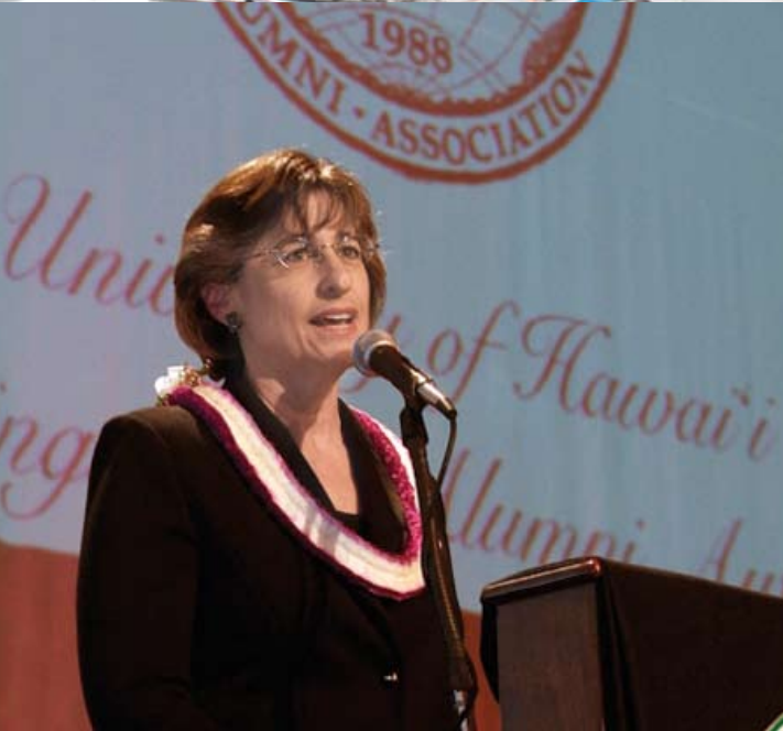
(Top) Governor Lingle talks with workers at the state's Unclaimed Property booth.