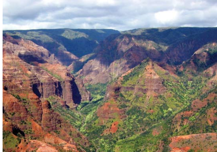
(Top) Energy Star recognizes the Kapolei State Building for being energy efficient. (Bottom) Waimea Canyon on Kauai.