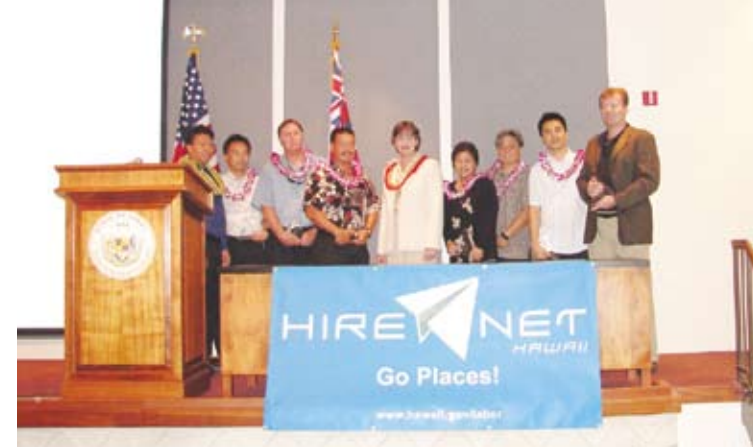
HireNet Hawaii, Department of Labor's online job resource, kicks off at the Capitol.