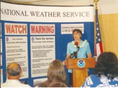
(Upper left) Bird Flu Exercise at the Pentagon. (Bottom Left) Pandemic Flu Summit. (Upper right) Governor Lingle prepares to inspect the damage following the Ka Loko Dam tragedy on Kaua'i. (Bottom right) Emergency Preparedness news conference.