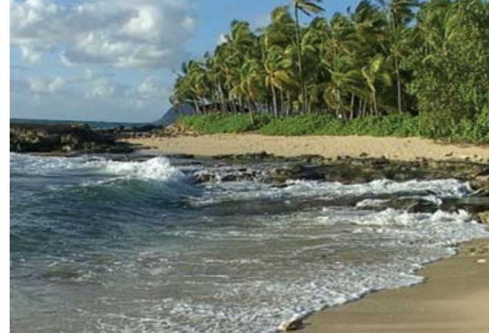
(Top) Governor Lingle celebrates with Maui Land and Pineapple Company Inc. on their 100th anniversary.