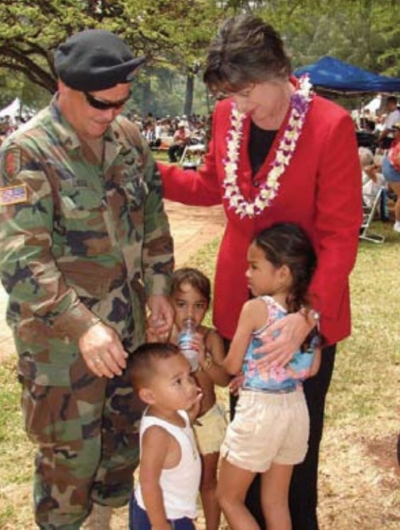
(Top) Governor Lingle and members of the North Shore Chamber of Commerce.