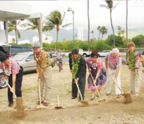
(Top) Governor Lingle convened a "Homelessness Solutions" meeting on O'ahu's Leeward Coast.