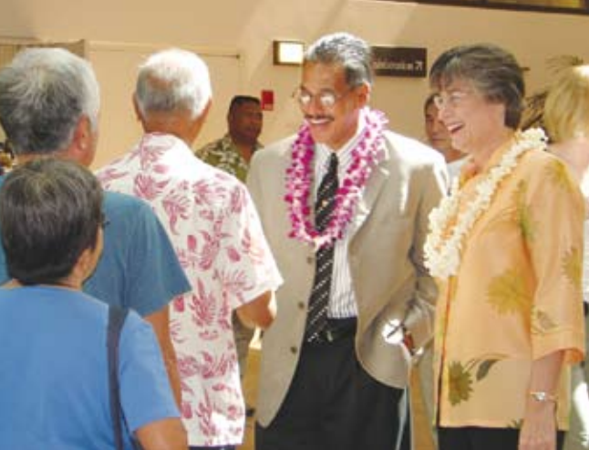
Hawai'i Seniors' Fair.