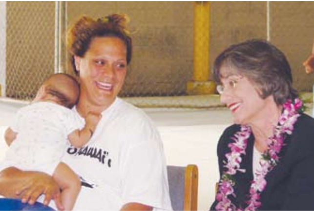
(Top) Visit with Honolulu Council of Girl Scouts. (Bottom) Next Step Shelter.