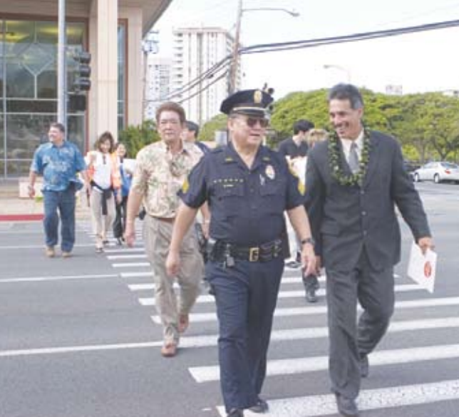
(Top) Governor Lingle, Lt. Governor Aiona and Hawai'i first responders.