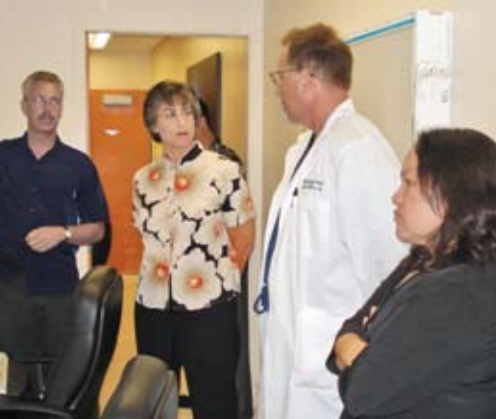
Governor Lingle attended the opening of Maui Memorial Hospital's new wing.