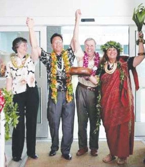
Maui Memorial Hospital dedication ceremony for new wing.