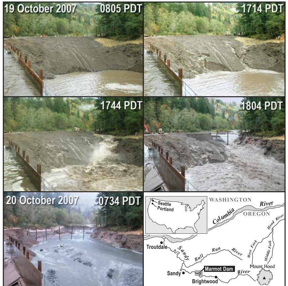
Fig. 1. Location of Sandy River, Marmot Dam and time-lapse images of breaching of the temporary earthen dam. The first image, at 0805 Pacific daylight time (PDT), was taken before the pumps dewatering the earthen dam were removed. Shortly after the pumps were shut off, water began seeping through the dam, gradually triggering small mass failures. Once all of the pumps were removed, crews carved a small notch in the dam crest and released the impounded water. Note the seepage and mass failures on the dam's downstream face evident by 1714 PDT, the channel and small knickpoints that developed as water overtopped the dam after it was notched, and the migrating headcut in the reservoir following breaching. By the following morning, the earthen dam and a substantial volume of stored sediment had been removed. Exposed well casings are about 10 meters tall. Note people for scale in some images. Data shown in Figure 2 were collected at U.S. Geological Survey gauging stations near Brightwood, Ore., and 450 meters downstream of Marmot Dam. Portland, Ore., is located 20 kilometers west of the Sandy River/Columbia River confluence.

Bed load transport also increased following breaching, but its response was slower than for suspended sediment. Bed load flux below the dam site increased from approximately 1 kilogram per second before breaching to 60 kilograms per second by 6 hours after breaching and to about 70 kilograms per second by 18 hours after (Figure 2d), in