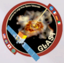
GLAST Burst Monitor — 2008, July 23, 23:37:42 UT