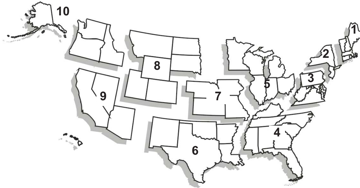
Figure TN2. Federal Regions