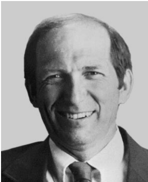
Wayne T. Gilchrest of Kennedyville (1st District) Republican—7th term