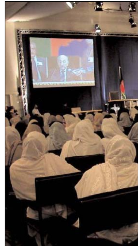
Women delegates at a Loya Jirga listen to King Zahir Shah.