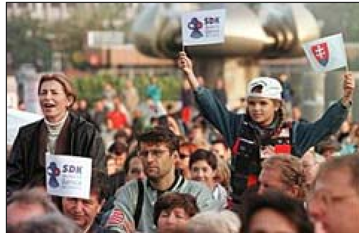
Rally for Democratic Reform Slovakia