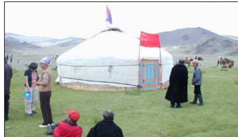
Rural voting station Mongolia June 2004