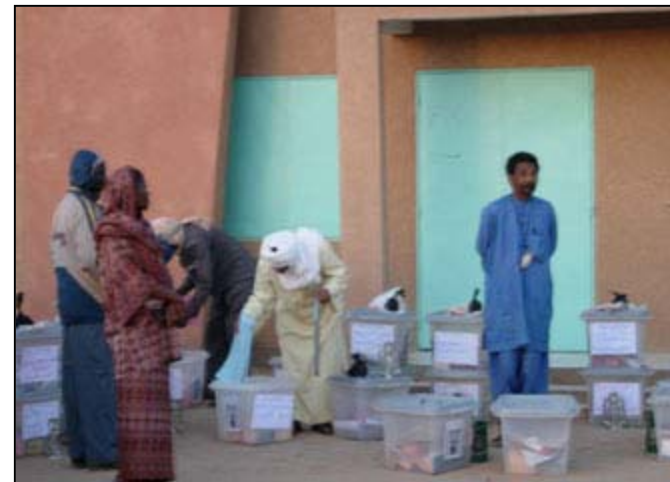
Elections in Burkina Faso Winter 2004