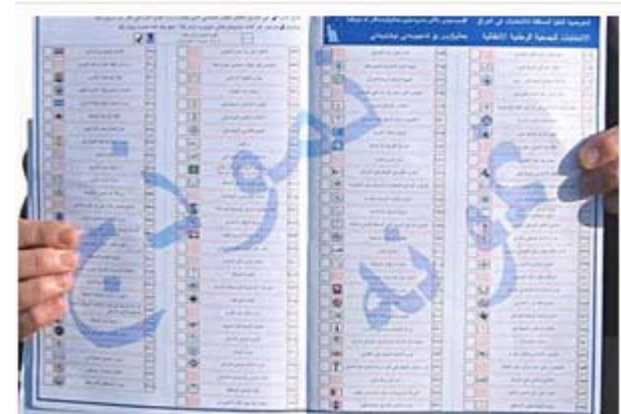
A ballot to be used in the January 30 th Iraqi election