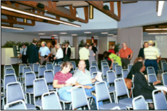
Members of the public arrive at the meeting.