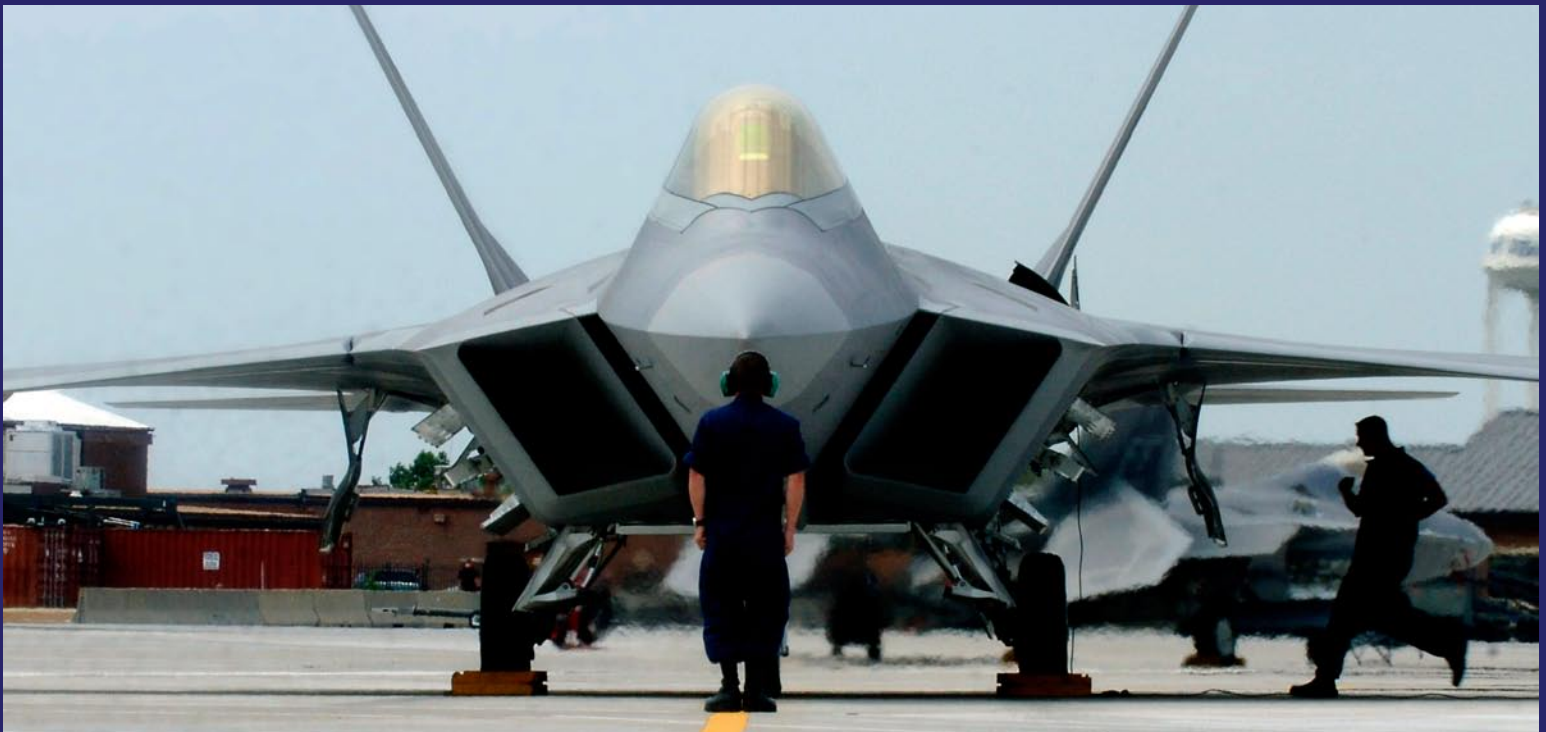
The United States Air Force F-22A "Raptor" Demonstration Team will be making a rare appearance at the Indianapolis Air Show.

I ndianapolis will not only be hosting the 2008 National Veterans Golden Age Games, the city will be presenting its 12th Annual Air show at the same time from August 22 through August 24. The Indianapolis Air Show is one of the largest, outdoor events in Indianapolis and will feature a world-class line-up of the best aerobatic performers and warbirds available. Highlights of the airshow include a rare appearance by the USAF