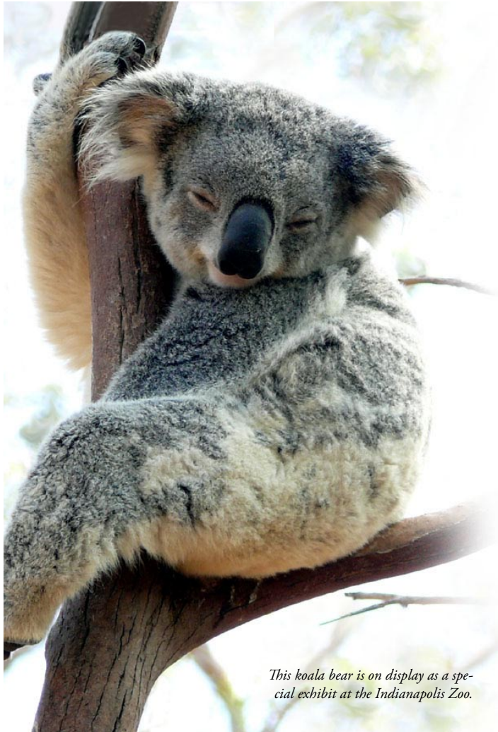
This koala bear is on display as a special exhibit at the Indianapolis Zoo.

Ⓢ THE OFFICIAL PUBLICATION OF THE 2008 NATIONAL VETERANS GOLDEN AGE GAMES Ⓢ