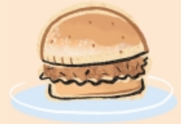
Barbecued Beef on Roll

A recipe is a pattern for success in food preparation!