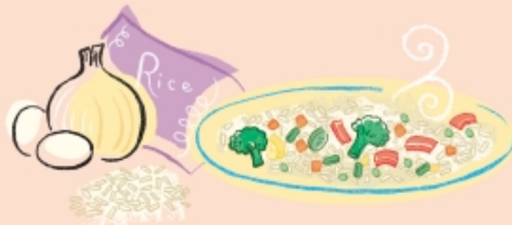
Stir-Fry Vegetables with Not Fried Rice