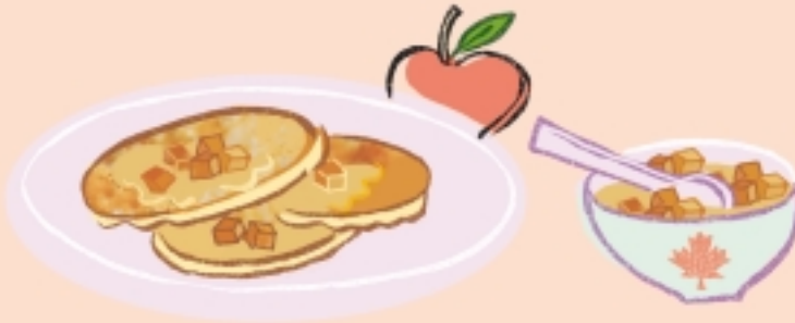
Pancakes with Maple Applesauce Topping