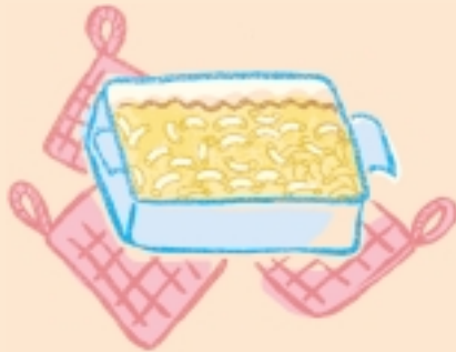
Macaroni and Cheese

A recipe is a pattern for success in food preparation!