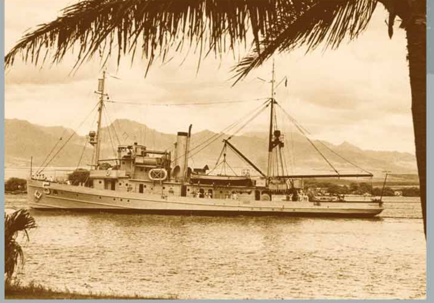
S.S. Tanager (AM-5) at Pearl Harbor before a successful sail to the Northwestern Hawaiian Islands, 1920s