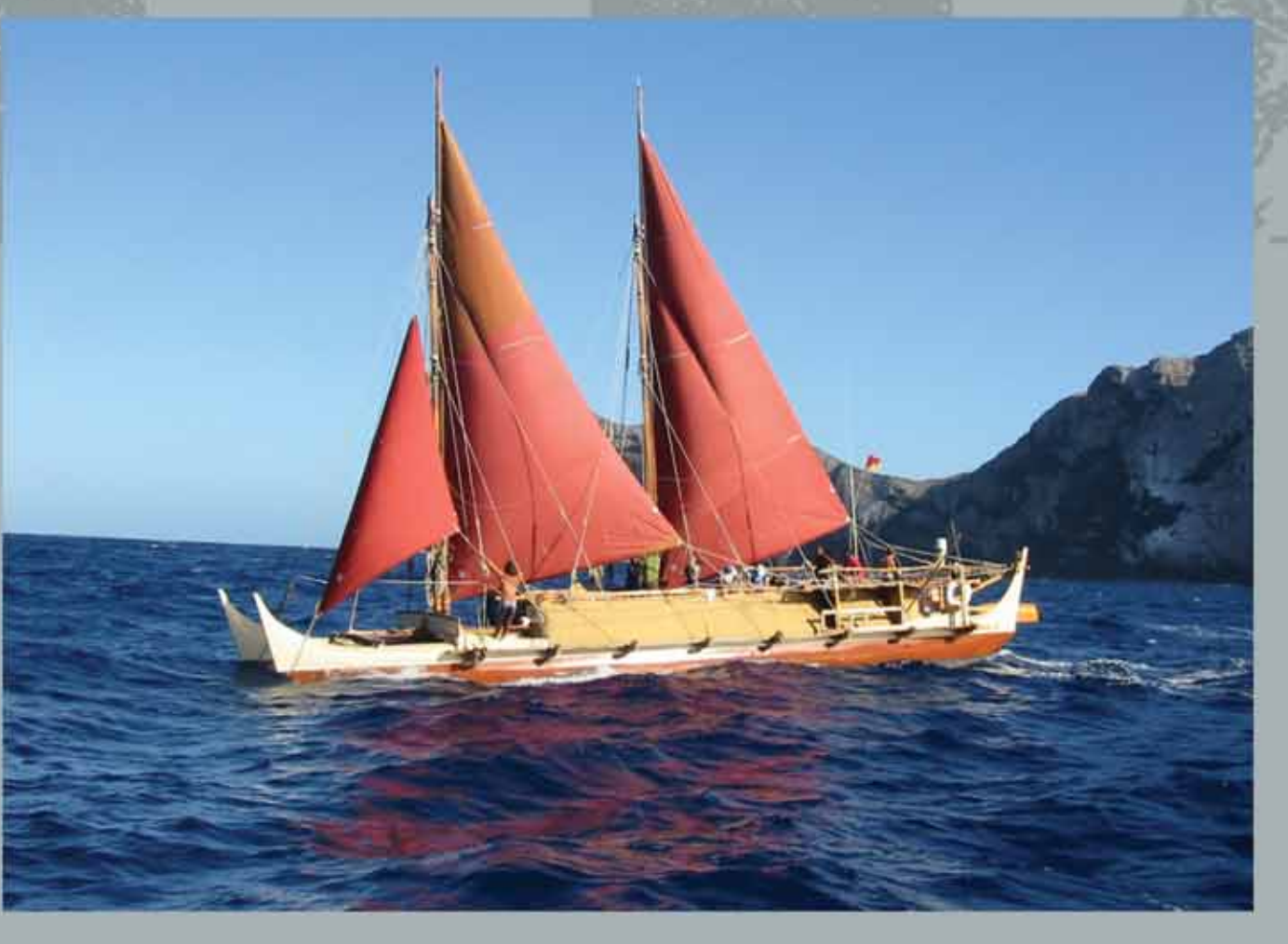
Double hulled sailing canoe Hokūleʻa , sailing in apahānaumokuākea Marine National Monument