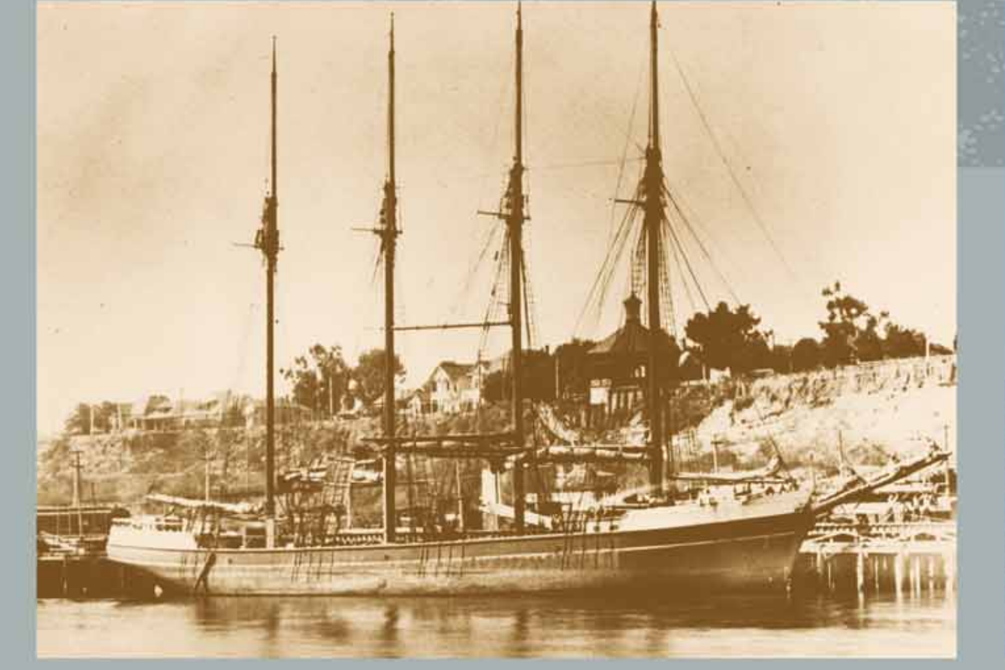
Oregon-built four-masted schooner Churchi lost at French Frigate Shoals 1917