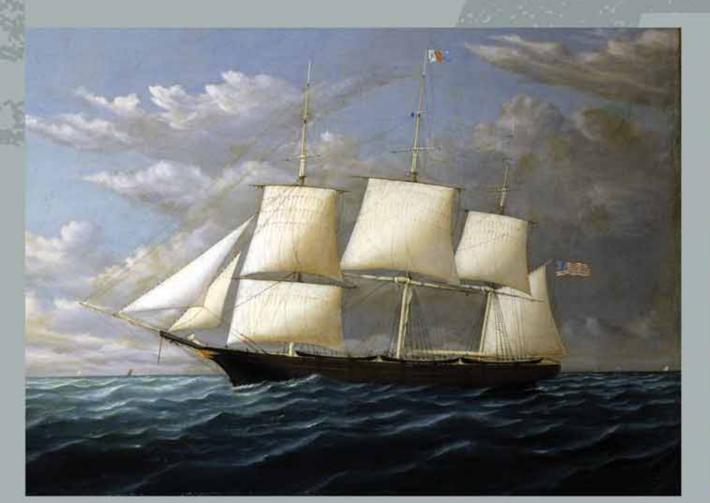
Whaling ship Daniel Wood , wrecked at French Frigate Shoals 1867