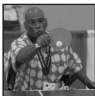
Table tennis is open to all competitors. Class IA, IB, and IC are permitted to secure the paddle to their hand by tape or a brace. All

competition is governed by The United States Table Tennis Association rules with modifications as necessary to accommodate wheelchair movement. A single-elimination system is used, which results in the loser of each match being eliminated from the competition and the winner advancing to the next round of play. Competition will be best three out of five. An 11-point scoring system will be used. No white shirts are allowed during competition.