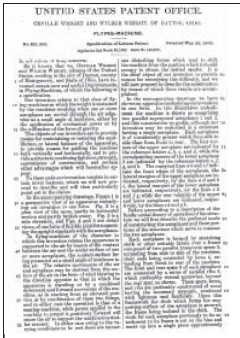
Figure 2 1st page of Specifications from U.S. Patent # 821,393

Please let us know if you have a favorite patent that you would like to see highlighted.