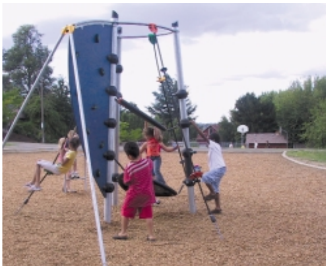
Portland, Oregon: Wilkes Neighborhood Park, a new 1.5 urban park with a basketball half court, play areas, and a paved walking path, was dedicated in August, 2004.