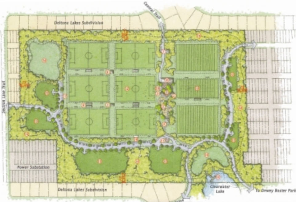
Deltona, Florida: Dewey Boster Sports Complex, a multi-field facility development also supported by Deltona and local recreation groups including Youth Soccer, Pop Warner Football League, and Pony Baseball.