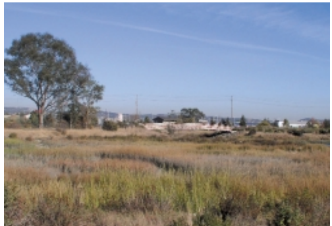
San Francisco Bay Trail, California: Tidewater Estuary Park, Oakland and Scottsdale Pond in Novato, both links on the San Francisco Bay Trail. Park improvements include accessible trails, picnic facilities, birdwatching platforms and trailhead parking.