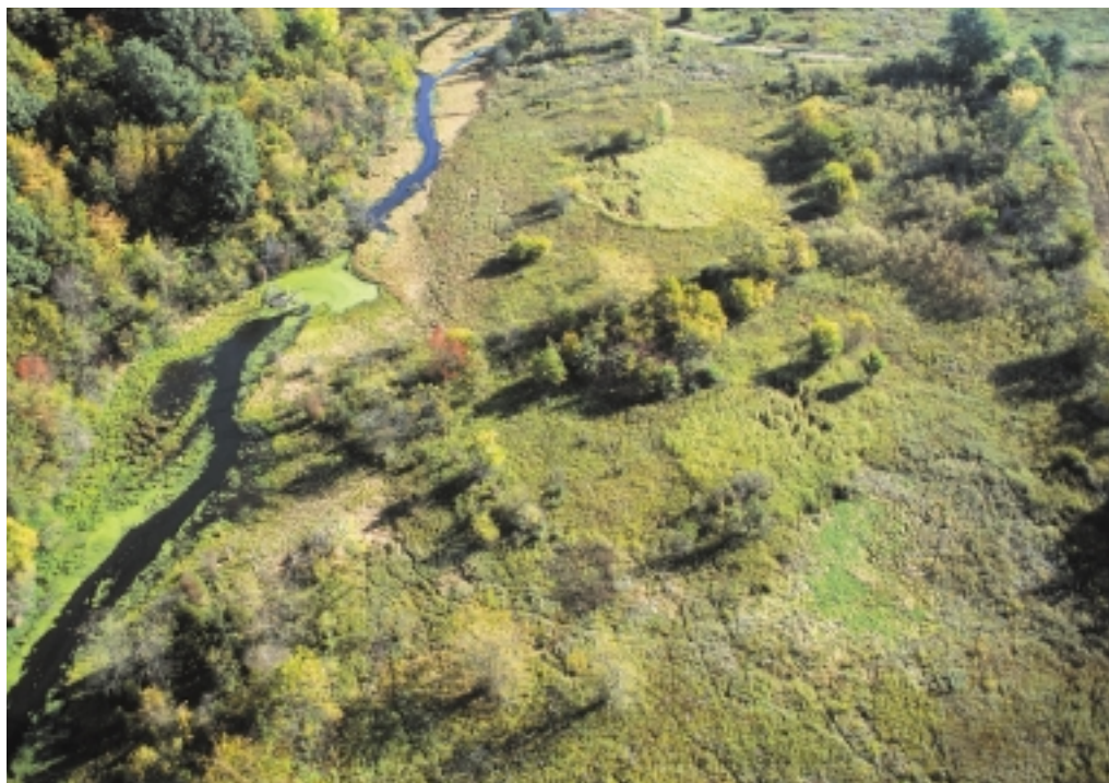
Tippecanoe County, Indiana: Prophetstown State Park, LWCF funding helped with the acquisition phase of Indiana’s newest state park, dedicated in August, 2004.