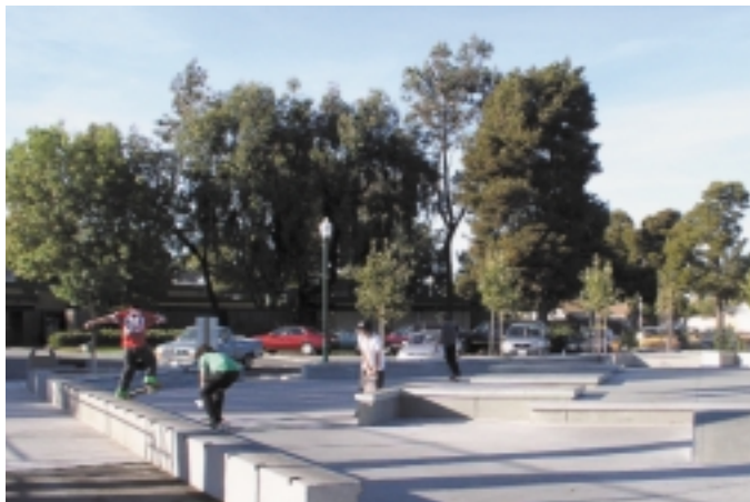
San Mateo, California: Shoreline Park, LWCF assisted development of a skate park, tennis and basketball courts.