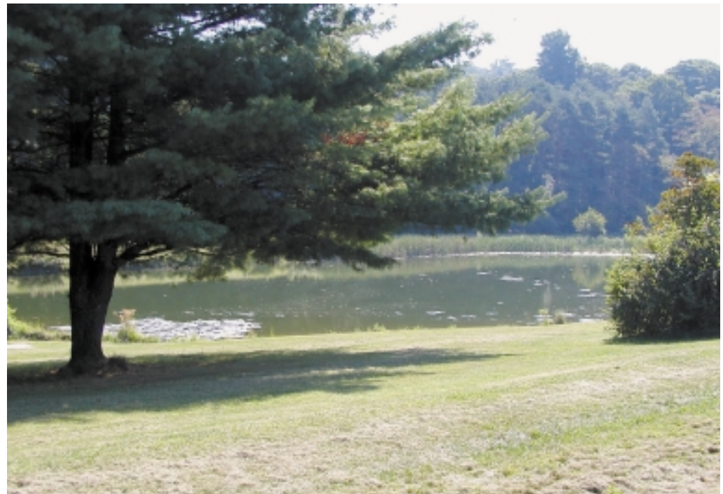
Baltimore County, Maryland: Purchase of the Yarema property, 177 acres of land in northern Baltimore County, will be developed into multiple recreational facilities while at the same time preserving a significant track of woodlands.