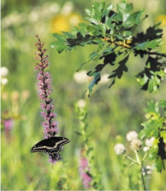
Tippecanoe County, Indiana: Swallowtail butterfly feeding on spiked lobelia, Prophetson State Park.

“This marvelous program allows Wyoming State Parks and Historic Sites an incredible opportunity to reach out to virtually every community in Wyoming. What a wonderful way to invest in Wyoming’s great people and places!”