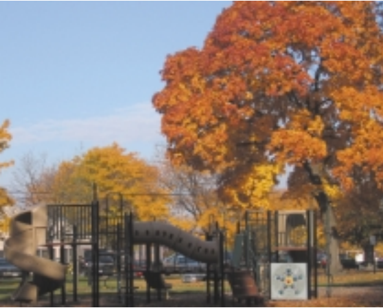
Akron, Ohio: Grace Park received an LWCF makeover which included replacement of deteriorating playground equipment.