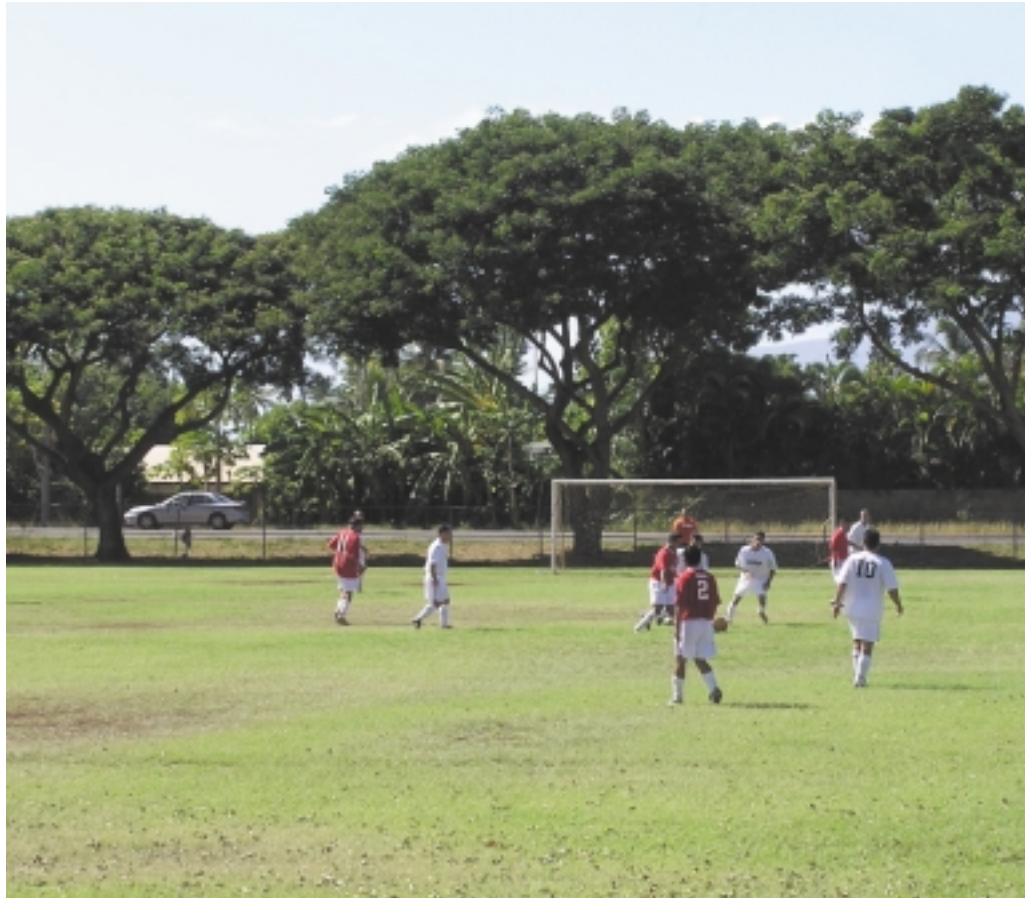
Maui, Hawaii: Soccer game at the Lahaina Recreation Center.