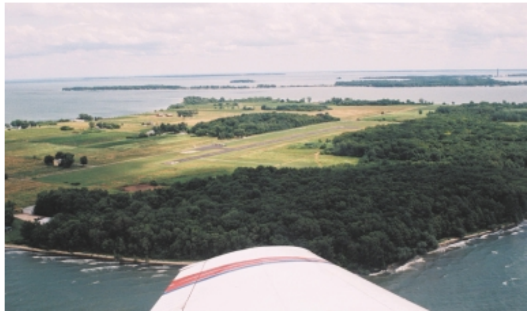
Ottawa County, Ohio: The Ohio Department of Natural Resources received the largest single-site state LWCF grant in the 40-year history of the program to protect North Bass Island, the last large undeveloped island on Lake Erie. The $6 million LWCF grant will be used to acquire approximately 357 acres.