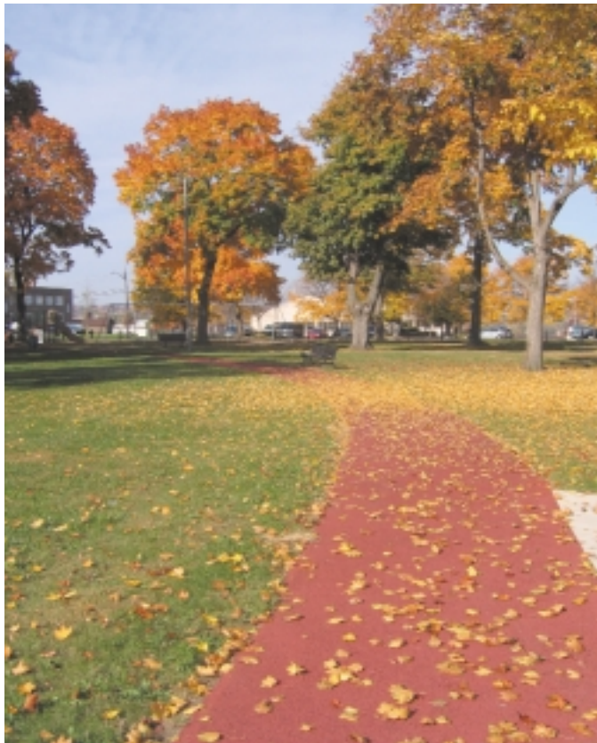
Akron, Ohio: Grace Park received LWCF funding for construction of a new system of accessible walkways.