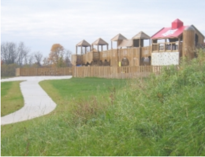
Green, Ohio: The 65-acre Boettler Park, located immediately west of the Akron/Canton Regional Airport, now has a new nature trail developed with a LWCF grant.