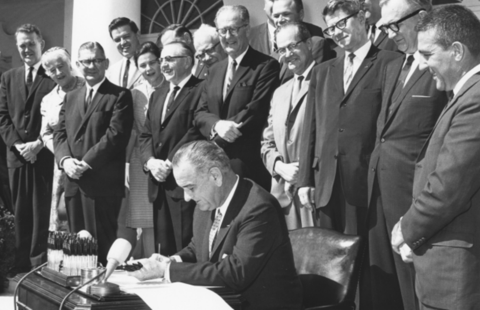
On September 3, 1964, President Lyndon Johnson signed the Land and Water Conservation Fund Act in a ceremony at the White House.