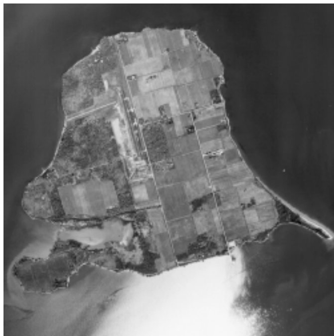
Ottawa County, Ohio: Recreation development on North Bass Island will include campgrounds, picnic areas, swimming, boating and fishing facilities, trails, hunting and natural areas.

The North Bass Island grant is a solid example of President Bush's commitment to supporting conservation and recreational opportunities in our nation's park areas. These awards of LWCF funds to state and locally sponsored projects will improve recreational opportunities for Americans.