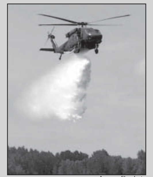
The Firehawk dumps a load of water during a demonstration.

PORTLAND—Soldiers in the 1042nd Medical Company were preparing for routine night training when the call came in. A wildfire was raging in north Portland, threatening nearly 100 homes and the University of Portland.