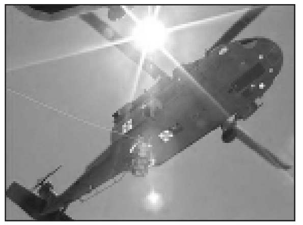
The 1042nd Medical Company doing what they do best: caring for Oregon's citizens in need.

At 10 p.m. on July 15, as many of Oregon's citizens were settling down for the night, a medical crew from the 1042nd Medical Company was preparing to leave Salem at the request of Oregon Emergency Management.