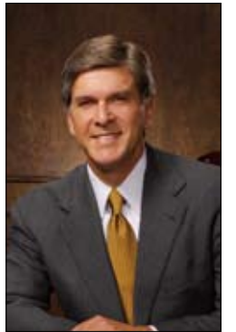
Sen. Gordon Smith, (R-OR).

The Defenders of Freedom Tax Relief Act must be approved by the U.S. House before becoming law.