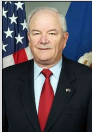
Michael W. Wynne, Secretary of the Air Force

As AFSO 21 training comes to your base, ask yourself, "What have I improved today?" Every idea is worth taking to your supervisor. To learn more about the AFSO 21 program, visit the AFSO 21 website at http://www.afso21.hq.af.mil/ . I have full faith that by implementing AFSO 21 together, we will make our Air Force not only more effective, but will drastically improve our combat capability.