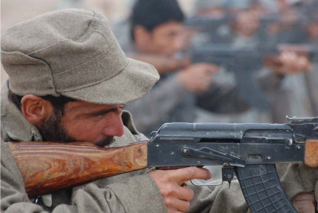
Afghan National Auxiliary Police recruits fire their AK-47 assault rifles at a training site in Andar district.