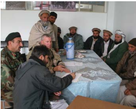
Village elders supervise the signing of the contract for new wells in Waisal Abad.

Story By Lt. Col. Donald Zimmerman HSSC ETT