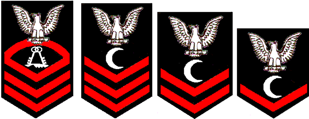
CHIEF COMMISSARY STEWARD