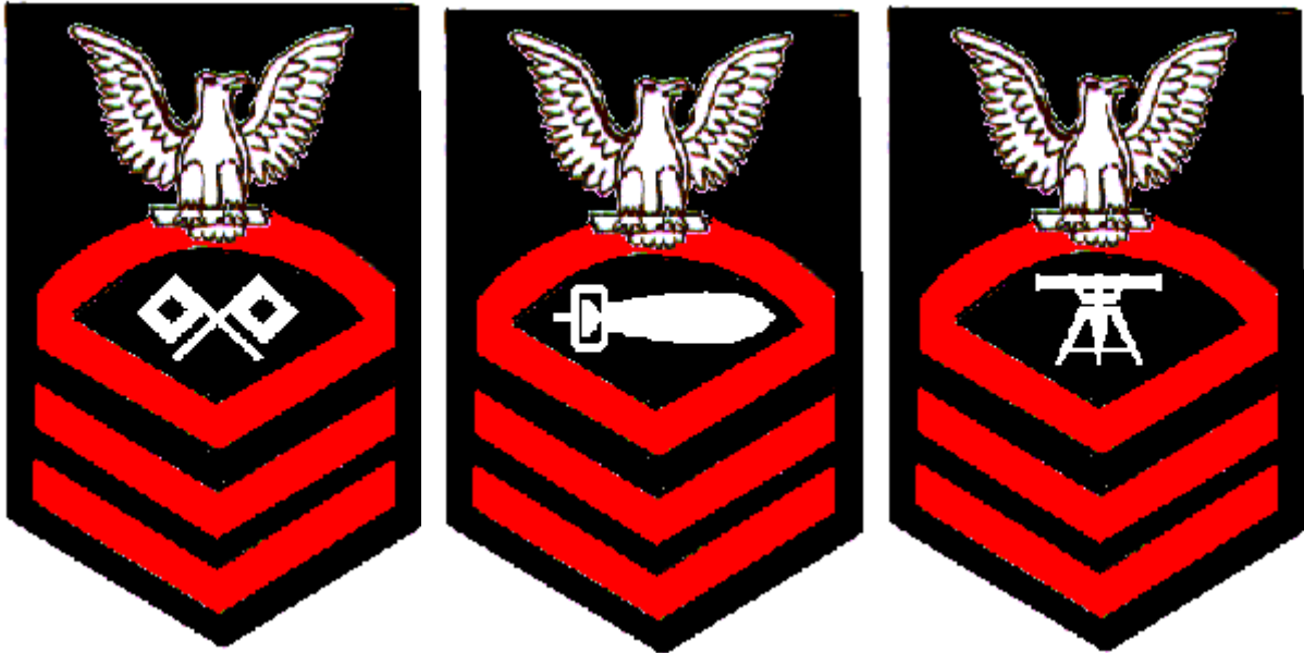
CPO LESS THAN 12 YEARS GOOD CONDUCT