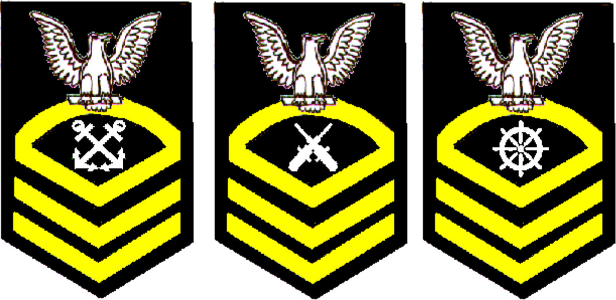
CPO WITH 12 YEARS GOOD CONDUCT