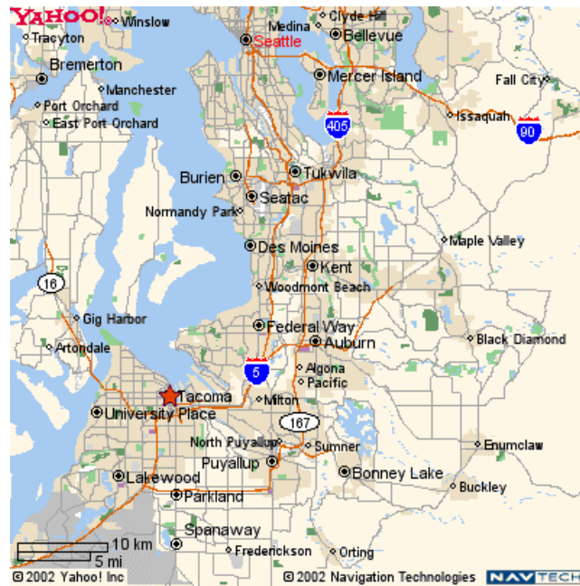
Figure 1-1. Vicinity Map