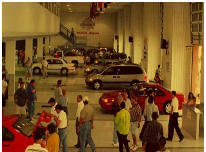
Figure 2 - Lanes at a Manheim Auto Auction

At the Manheim Auction located in Manheim, Pennsylvania, 15,000 automobiles can change hands each Friday. The speed of the auctions is remarkable. Most vehicles are sold in seconds. The seller is identified through a series of hand gestures and other signals while the auctioneer rattles off prices (Bradsher). The business is built largely on trust. Before bidding begins, buyers typically examine for less than a minute a vehicle on which they plan to bid. “When a seller disposes of even a few defective vehicles, it is widely talked about within weeks, and buyers simply refuse to bid on the seller’s cars, or bid low” (Bradsher).