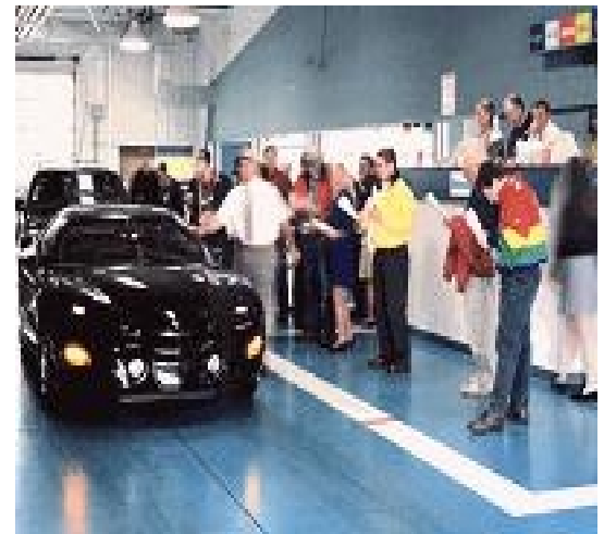
Lane at an Adesa Auction