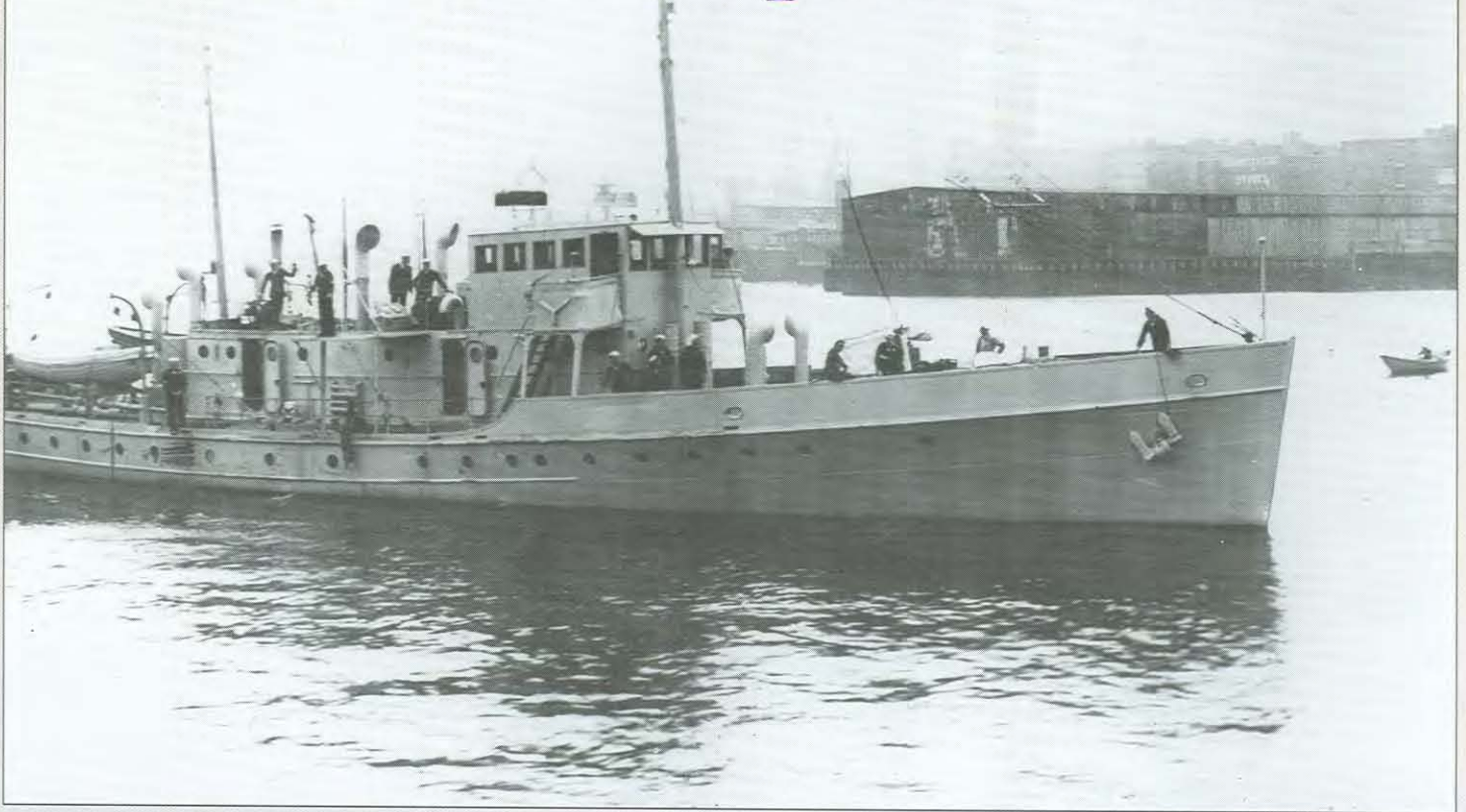
The Marion leaves Boston for the Coast Guard's first official oceanographic research cruise in July 1928.

in Greenland and transported by the Marion , was shipped to the National Zoo in Washington.