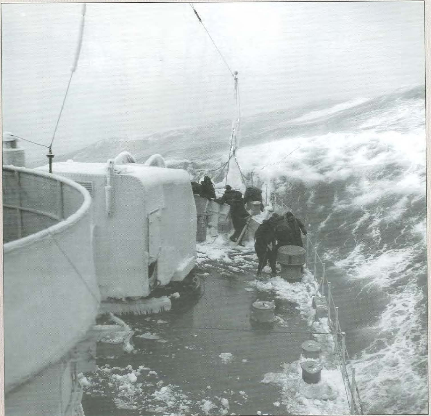
The CGC Pontchartrain battles the North Atlantic on Ocean Station Baker, circa 1949.

series of deep-sea oceanographic data buoys, while oceanographers from the University of Washington, carried aboard the CGC Northwind , studied changes in water conditions in the Beaufort and Chukchi seas.