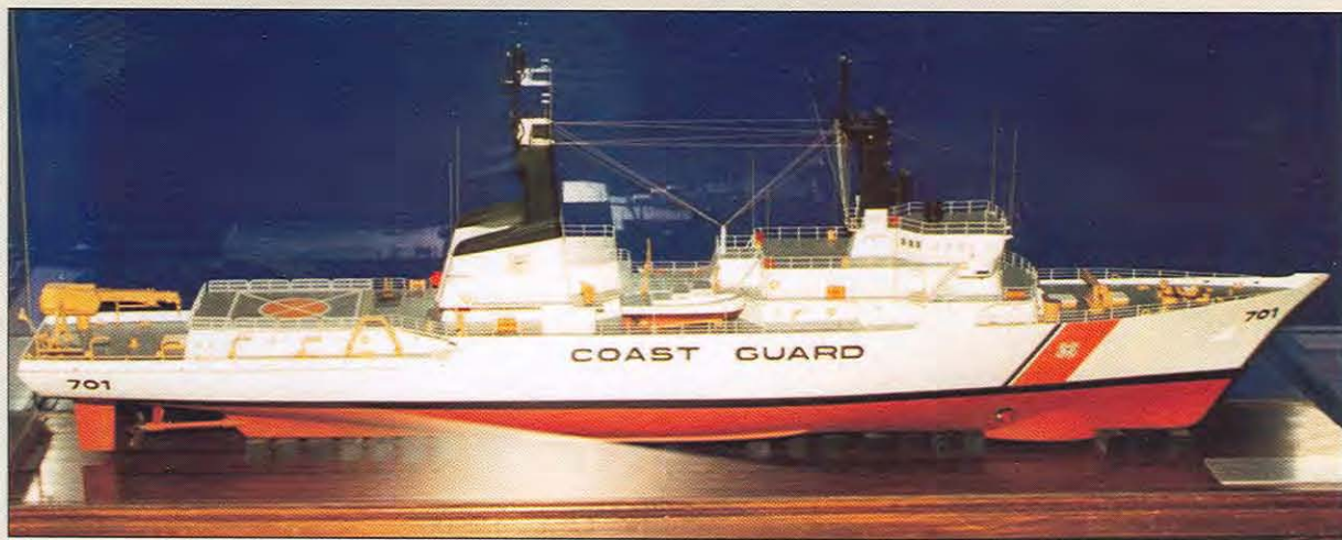
A model of the WHEO 701, the never-built oceanographic vessel.

By the late 1970s, a new satellite transmission receiving station was installed at the oceanographic unit office at the Navy Yard. But the number of personnel at the unit was steadily shrinking. Satellites and computers were taking over functions that in decades long past oceanographers