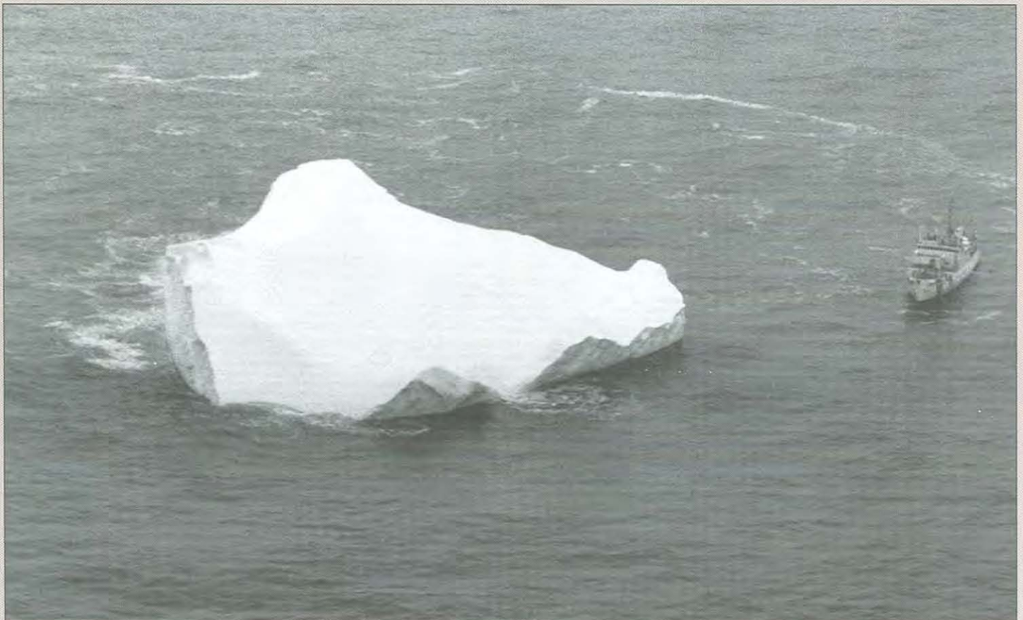
While on the Grand Banks in 1976, the oceanographic vessel CGC Evergreen demonstrates the Coast Guard's continued vigilance in the

At exactly 4 p.m. Sept. 16, the cutter returned to Steamboat Wharf at Vineyard Haven. A polar bear cub captured