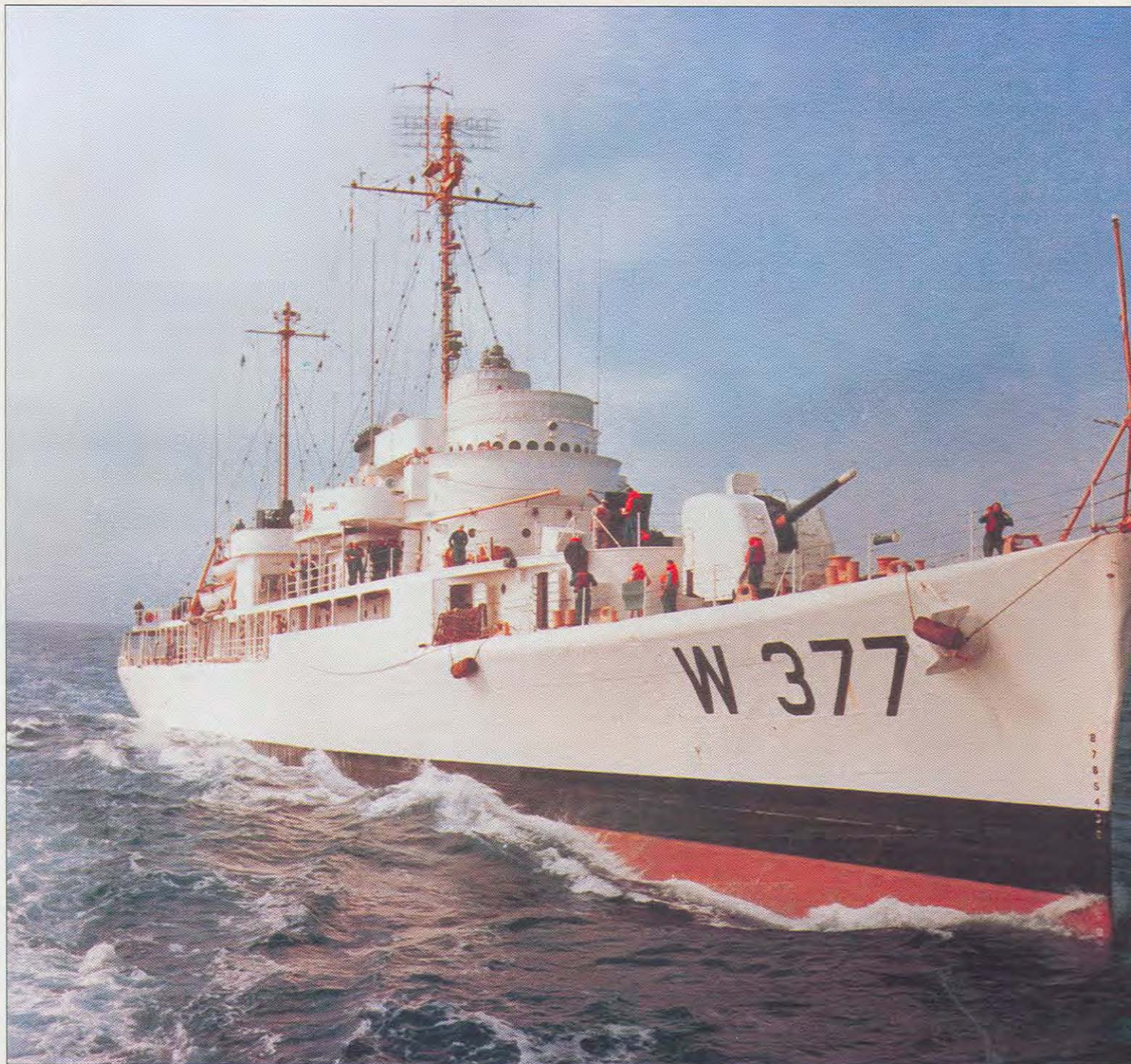
The CGC Rockaway underway for a Tropical Atlantic oceanographic mission in 1966.

Congress authorized construction of what would have been the largest, most modern oceanographic vessel in the western world. The 399-foot high-endurance oceanographic vessel WHEO-701 was to have set sail in 1972, and replace the venerable Evergreen . The new cutter would have displaced 3,945 tons and been equipped with a fully-automatic steam-propulsion system that could operate without a crew.