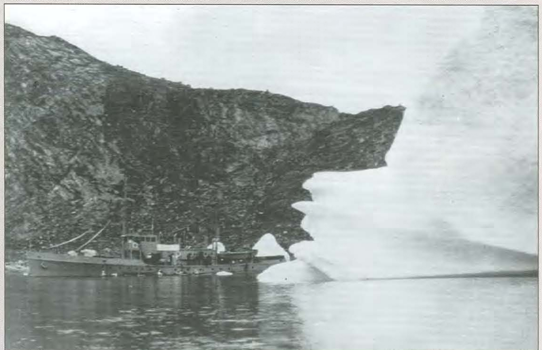
The Marion passes an iceberg in Disko Bay, Greenland, near Atu, August 1928.

The crowning glory of nearly a century of Coast Guard oceanographic research was to have come in 1969, when