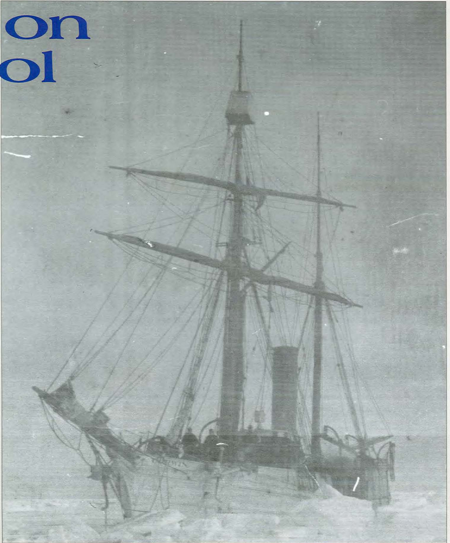
The Revenue Cutter Service vessel Corwin on Bering Sea patrol.