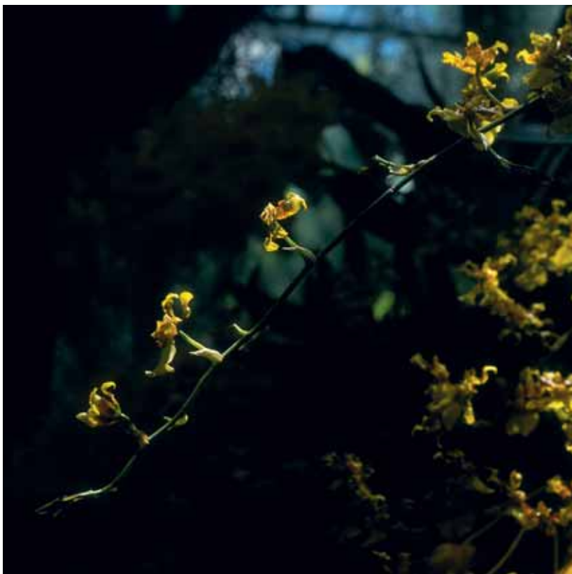
(ABOVE LEFT) GOLDEN SHOWER ORCHID ( Oncidium sphacelatum ).