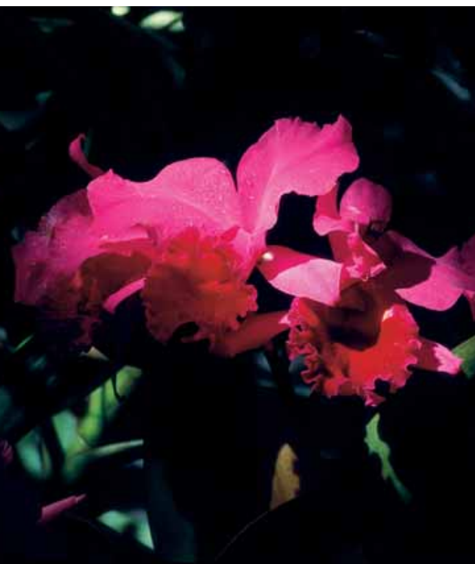
(ABOVE) ORCHID ( Laeliocattleya BARRY STARKE 'THE KING').