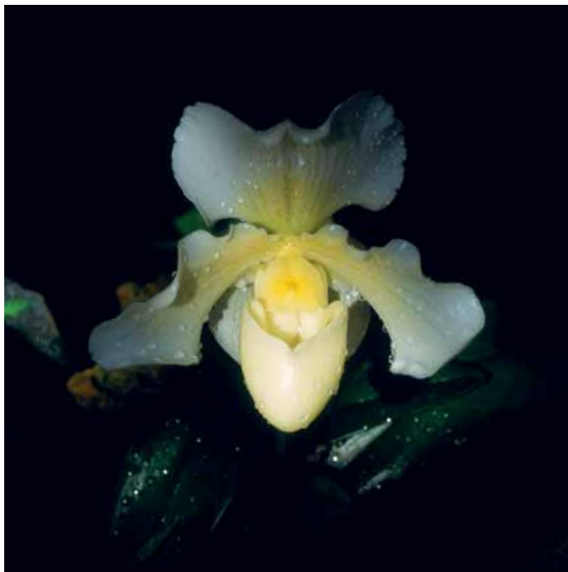
(ABOVE RIGHT) ASIAN SLIPPER ORCHID ( Paphiopedilum F. C. PUDDLE).