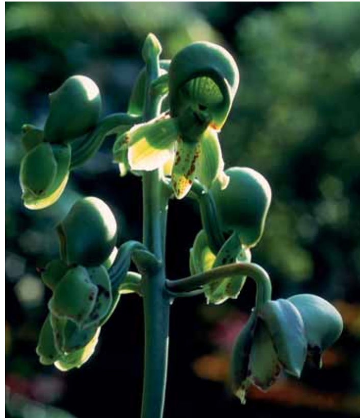
(ABOVE) ORCHID ( Catasetum JUMBO EAGLE ).