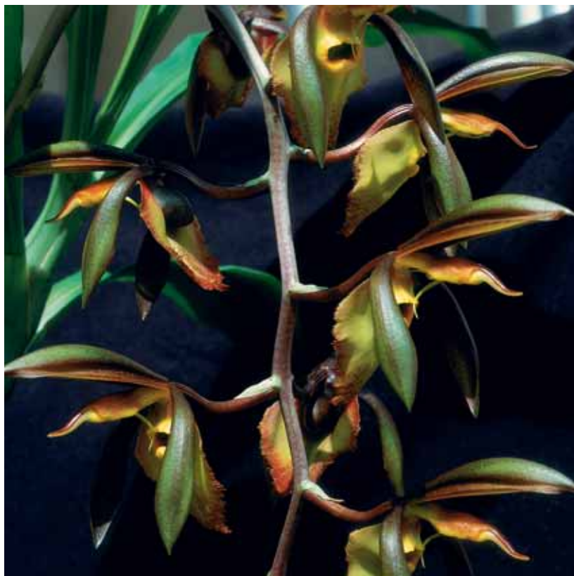
(OPPOSITE) ORCHID ( Cattleya maxima ).