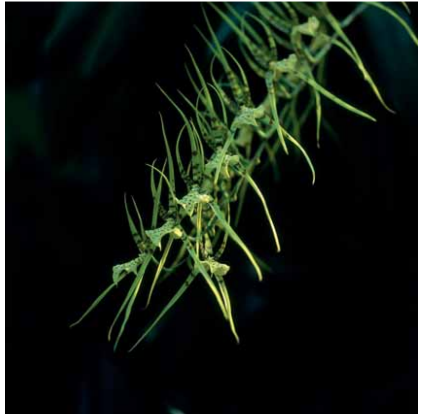
(OPPOSITE) PANSY ORCHID ( Miltoniopsis DRAKE WILL 'RUBY FALLS').

The same principles that apply to the roots of epiphytes also work for orchids that have adapted to survival on rocks and stones. Called lithophytes, these grow in the cracks between stones or creep along the surface of boulders, soaking up whatever moisture accumulates there. Terrestrial orchids grow in the ground like other familiar plants.