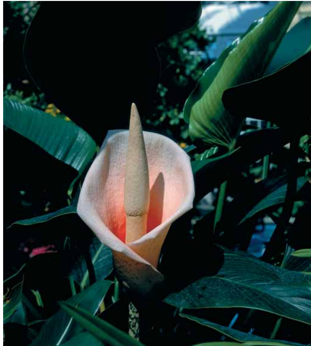
(ABOVE) Amorphophallus bulbifer.

People rely on a wide variety of plants for many basic needs, including food, dyes, medicine, wood, fiber, flavoring, industrial products, fragrances, and cosmetics. The plants on display represent a tiny fraction of the botanical resources that have contributed to the economic well-being of cultures throughout the world. Though the plants themselves may not be familiar, their products certainly will be. Huge, floating leaves of banana trees ( Musa 'Saba' ) conceal the familiar bunches of ripening fruit. Though each tall stalk looks like a separate tree, the plant is actually a clump of several stalks. As soon as the fruit has ripened, each stalk will die back, to be replaced by several new stalks as the cycle begins again. Other important food sources on display include chocolate ( Theobroma cacao ) from the Amazon Basin, tea ( Camellia sinensis ) from Southern Asia, and coconut ( Cocos nucifera ). Herbs and spices are represented by the cinnamon tree ( Cinnamomum zeylanicum ), whose bark is used to produce the pungent flavoring, and by vanilla ( Vanilla planifolia ), a climbing orchid from Mexico and Central America that, outside of its