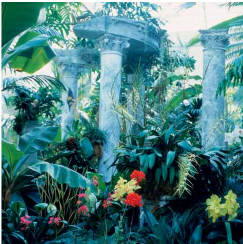
(TOP) ORCHIDS DISPLAYED AMONG THEATRICAL TEMPLE RUINS DURING THE ANNUAL ORCHID EXHIBIT.