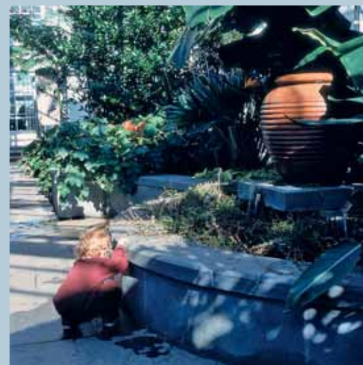
(ABOVE) DISCOVERING THE CONSERVATORY.

The mission of the U.S. Botanic Garden goes beyond celebrating the allure of plants, however. In order to promote an understanding of botanical knowledge, engaging displays present the facts and the fascinating stories of the plant world. Plants are present everywhere on the planet—from the steamiest lowlands to the coldest mountaintops—yet all too often they are overlooked and misunderstood, despite their importance to human survival. Without plants there would be few sources for food, medicine, clothing, shelter, and, most important, oxygen. People have a tremendous impact on plants, through discovery and cultivation, but also through destruction of plant habitats. Globally, about one out of every eight known plant species is threatened or nearing extinction. In the United States, the figure stands at about one out of every ten plant species. Conservatory exhibits bring these startling numbers to life by featuring endangered plants and demonstrating conservation strategies. A tour through the glorious green surroundings of the Conservatory is delightful to the senses and refreshing to the spirit, but visitors also leave with awareness of the many ways in which the destinies of humans and plants are intertwined.