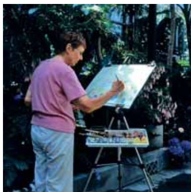
(OPPOSITE) LIGHT SPILLS ACROSS THE STONE FLOOR OF THE GARDEN COURT.

native range, must be hand-pollinated to increase production of its seeds. A number of the tall trees that line the Garden Court produce materials for building. Spanish mahogany ( Swietenia mahagani ) is renowned for its hard, deep red wood prized by cabinet-makers throughout the world. Native to the New World, the original West Indies mahogany was harvested to near extinction during Colonial days to meet European demands for its wood. Timber bamboo ( Bambusa vulgaris ), though actually a spreading grass, is used throughout Asia to build sturdy homes.