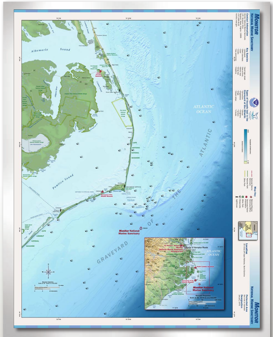
Sanctuary maps available at sanctuaries.noaa.gov

Divers also verified that lionfish have arrived at the Monitor . Lionfish were first reported in coastal North Carolina in 2000 by recreational scuba divers exploring wrecks off Morehead City, located approximately 50 miles to the south of Monitor National Marine Sanctuary. Lionfish are considered an invasive species and their spread up the Atlantic Coast is being watched carefully by sanctuary staff and NOAA's National Centers for Coastal Ocean Science.