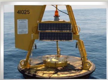
A NOAA data buoy provides real-time information on water and weather conditions.