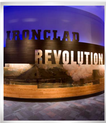
The Monitor Center opened March 9, 2007 in Newport News, Va.