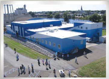
The Great Lakes Maritime Heritage Center has received awards for its eco-friendly design.