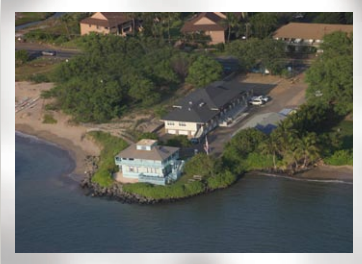
A new multipurpose visitor center is under construction in Kihei, Maui.